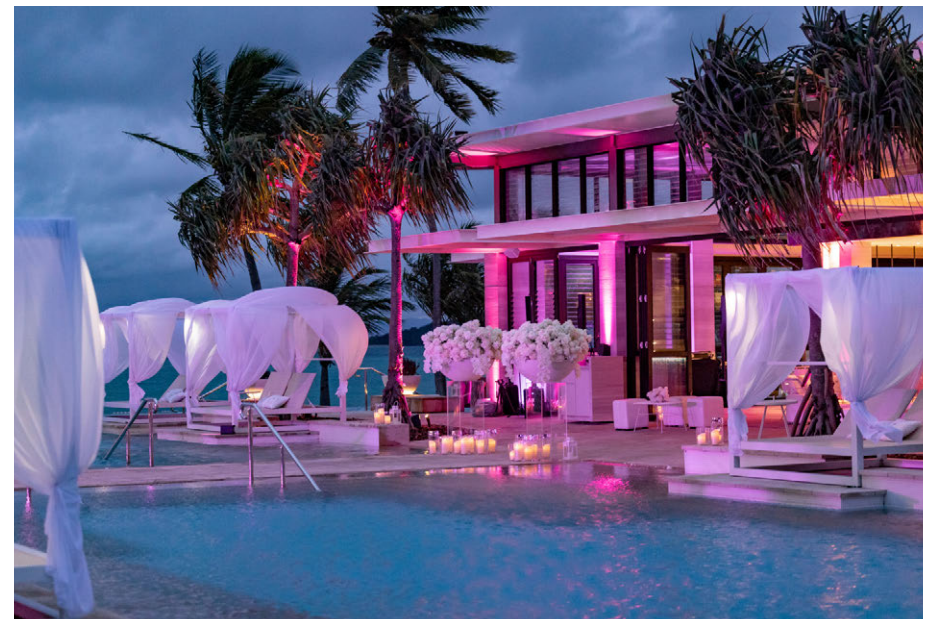
Ariana Photography Studio & Diane Khoury Weddings