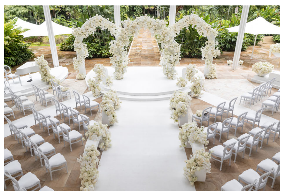
Ariana Photography Studio & Diane Khoury Weddings