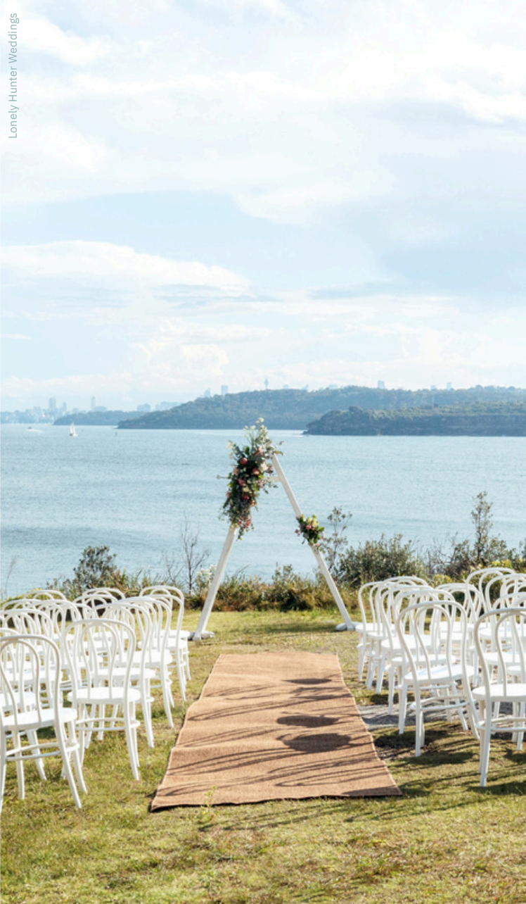
Lonely Hunter Weddings