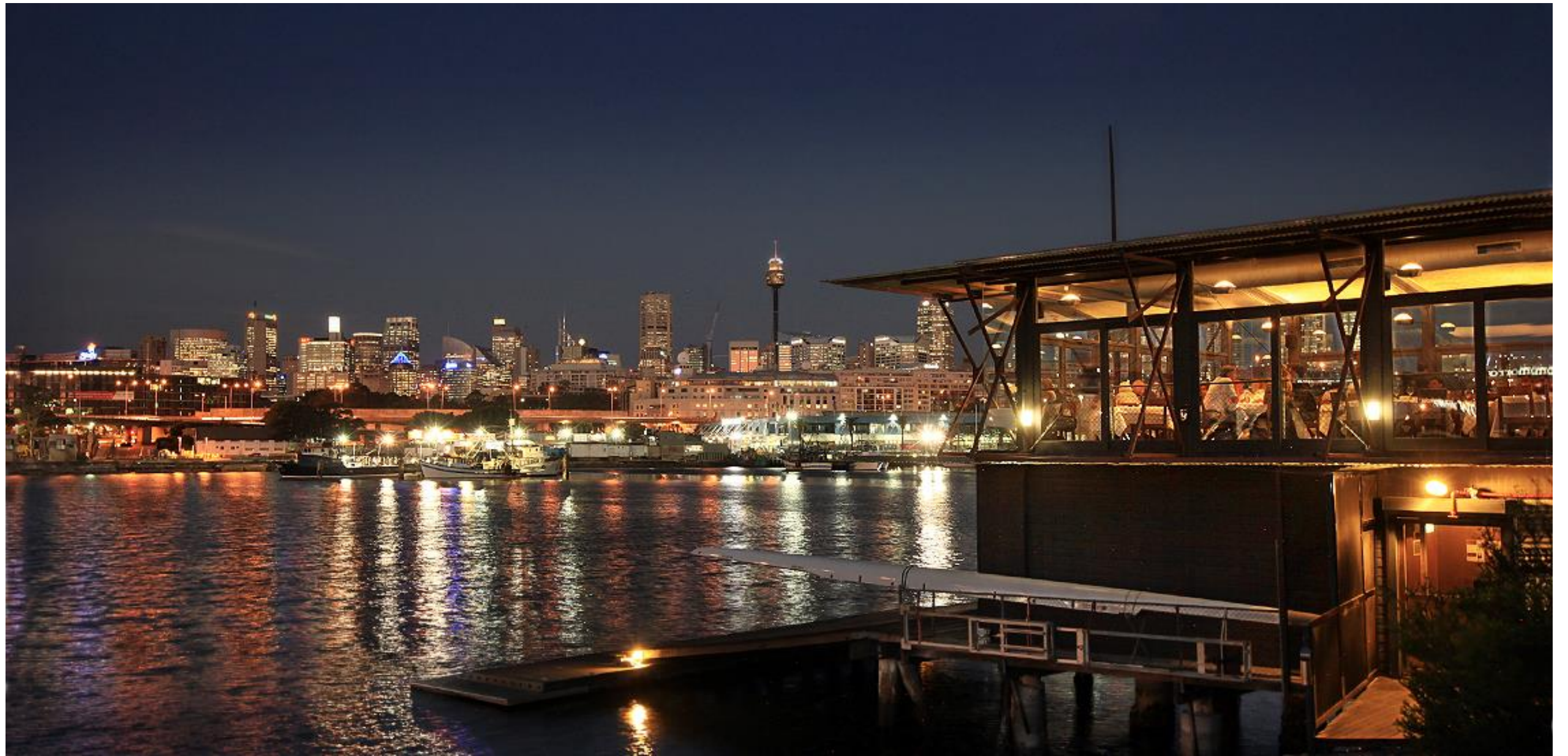
THE BOATHOUSE ON BLACKATTLE BAY