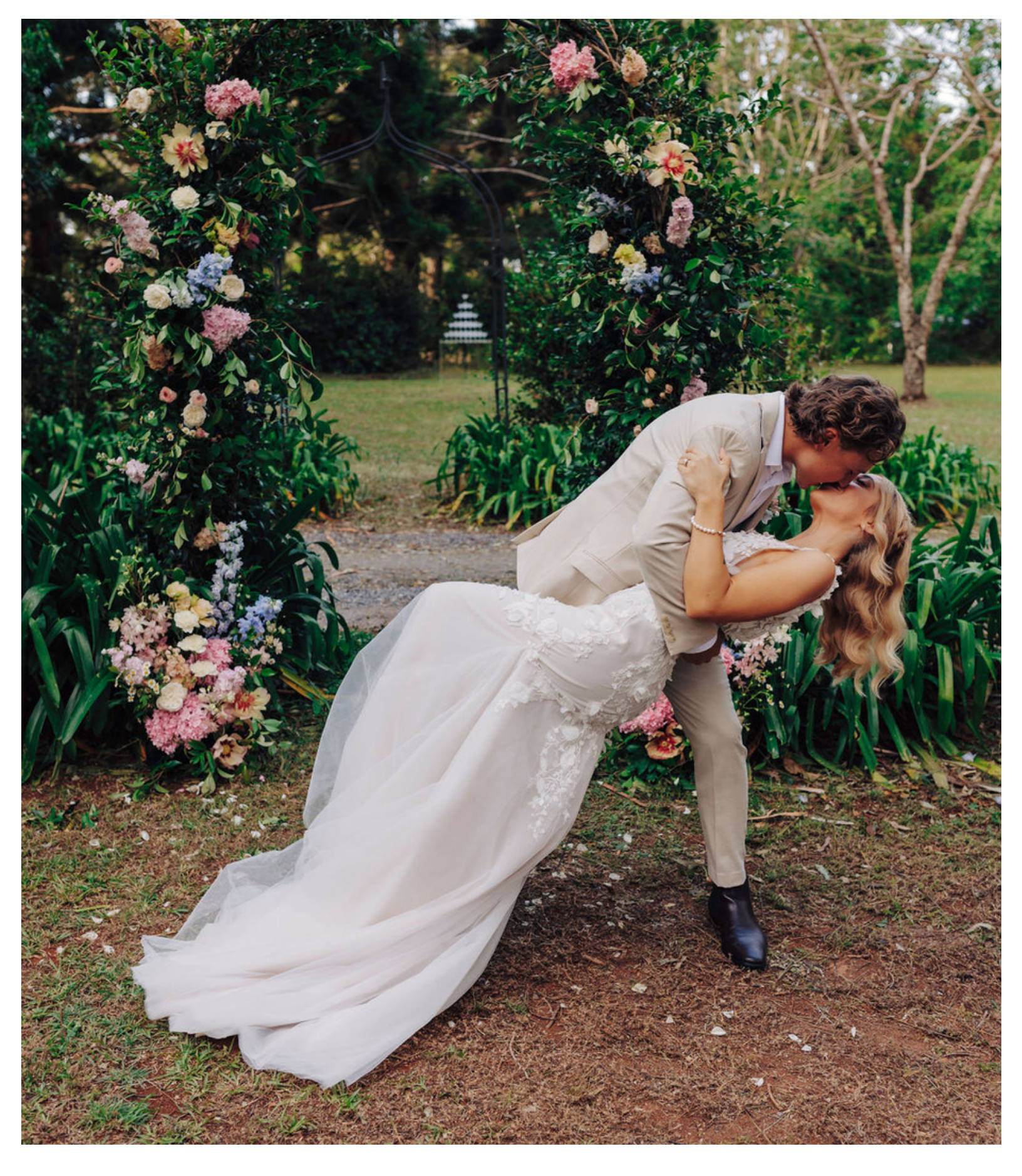
WEDDING & ELOPEMENT PACKAGES