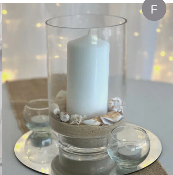
boho beach - fishbowl with pillar candle and shells. *own baby's breath to be supplied