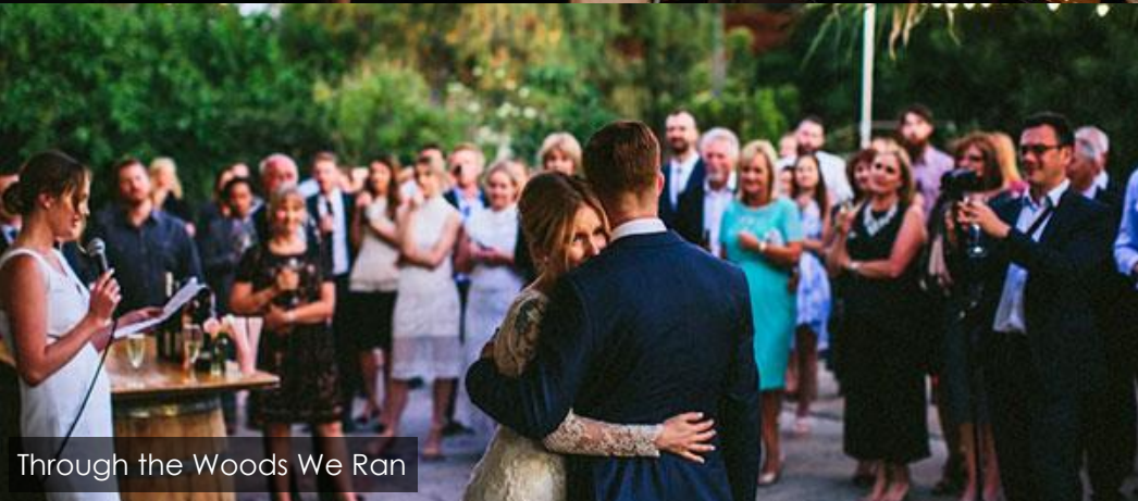
Through the Woods We Ran