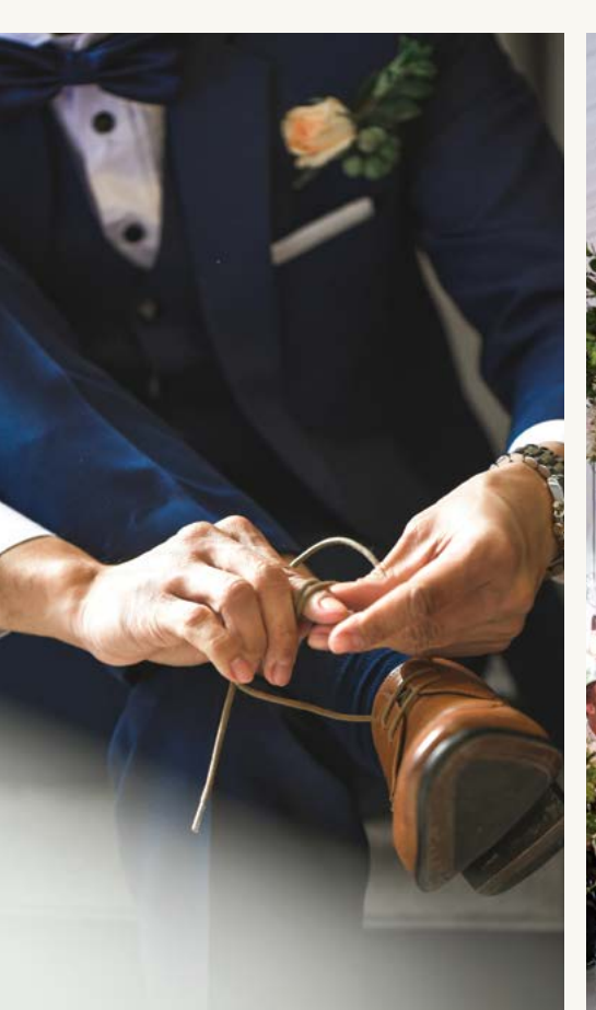
Terms & conditions apply. Additional add on's and upgrades available, please contact us for options.