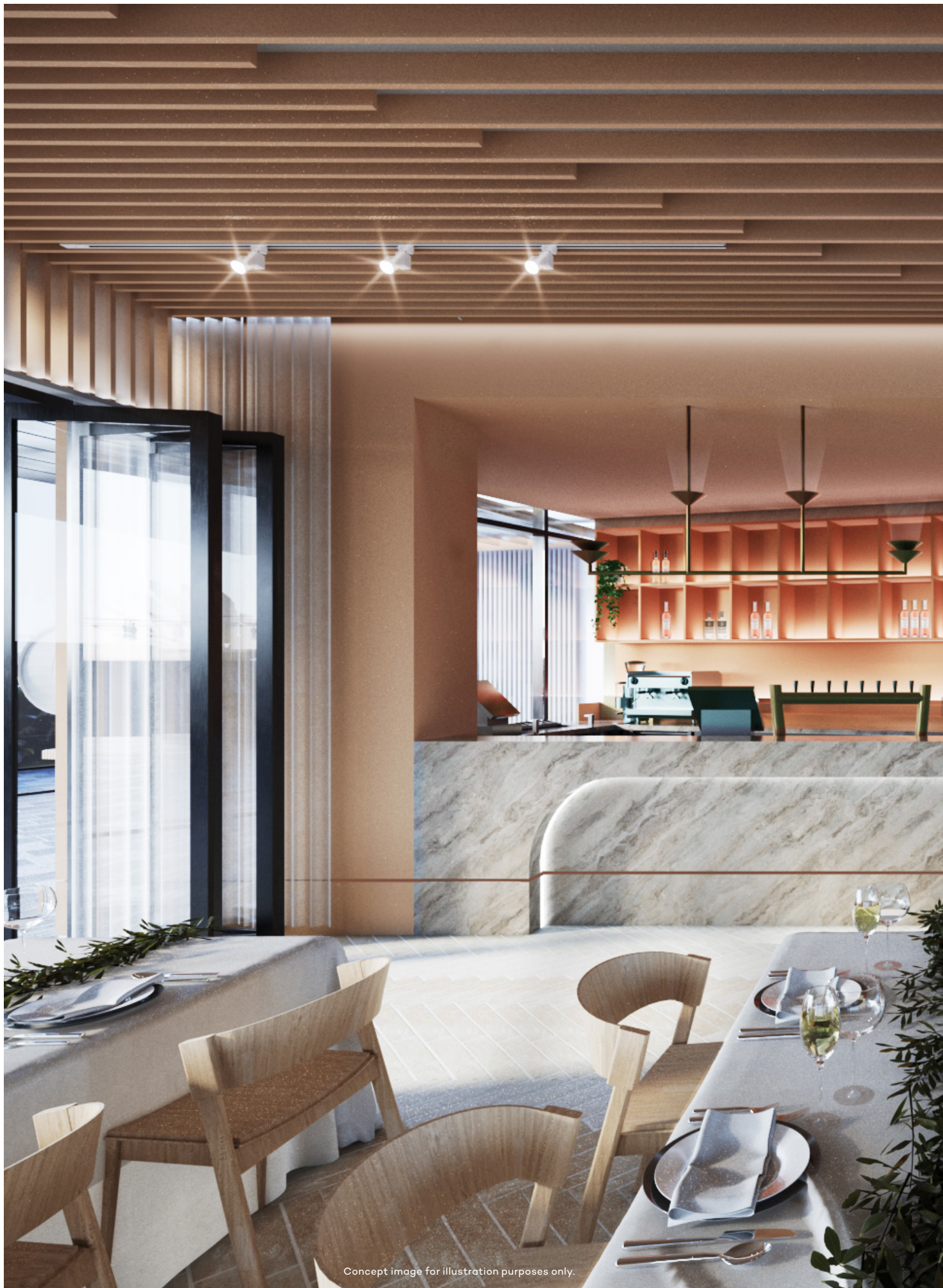
Concept image for illustration purposes only.