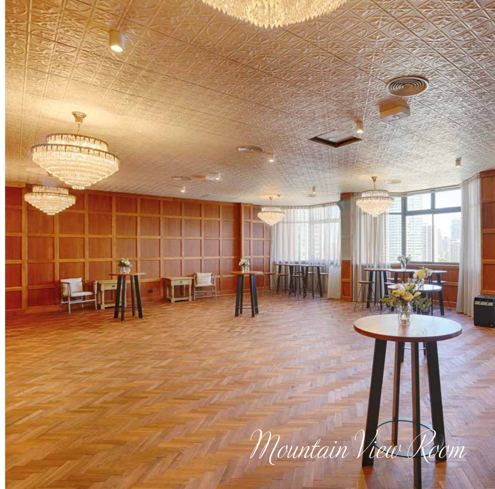
Mountain View Room