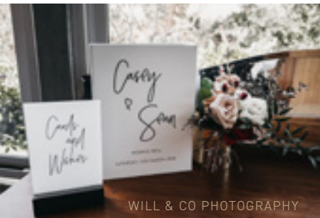
WILL & CO PHOTOGRAPHY