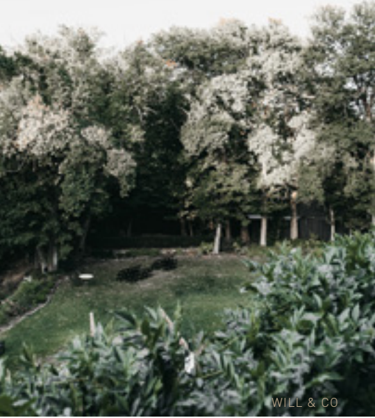
WILL & CO