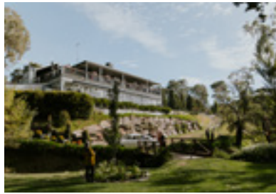
WILL & CO