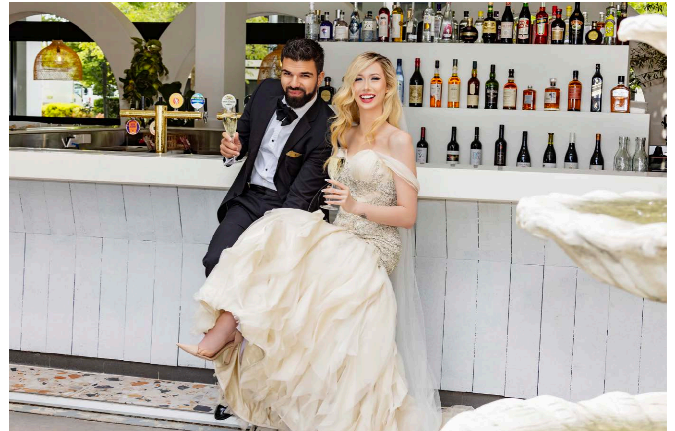
Our sun-drenched courtyard is the perfect setting for drinks, canapes (or even vows) before heading upstairs to feast and party.