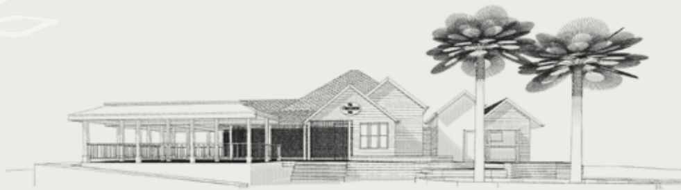
Sketch by Maytree Studios