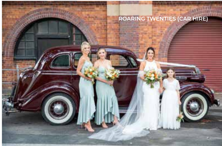
ROARING TWENTIES (CAR HIRE)