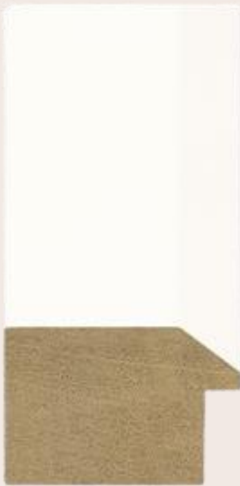
MANHATTAN - MATTE WHITE A65104