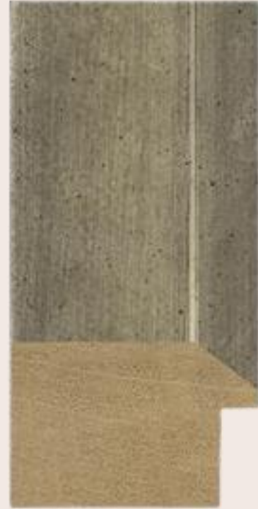
MANHATTAN - CONCRETE A65102