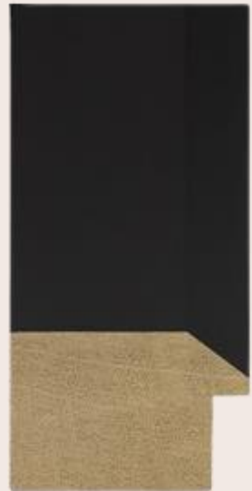
MANHATTAN - MATTE BLACK A65103