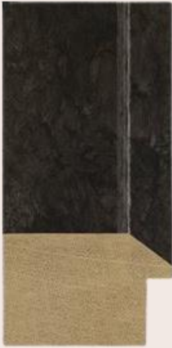
MANHATTAN - BRONZE A65101