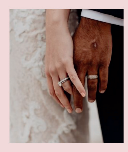
Bippity-Boppity Bride & Groom

Full planning from as far as 12 months out - including complimentary templates, budget tracker & checklists on planning and vendor bookings