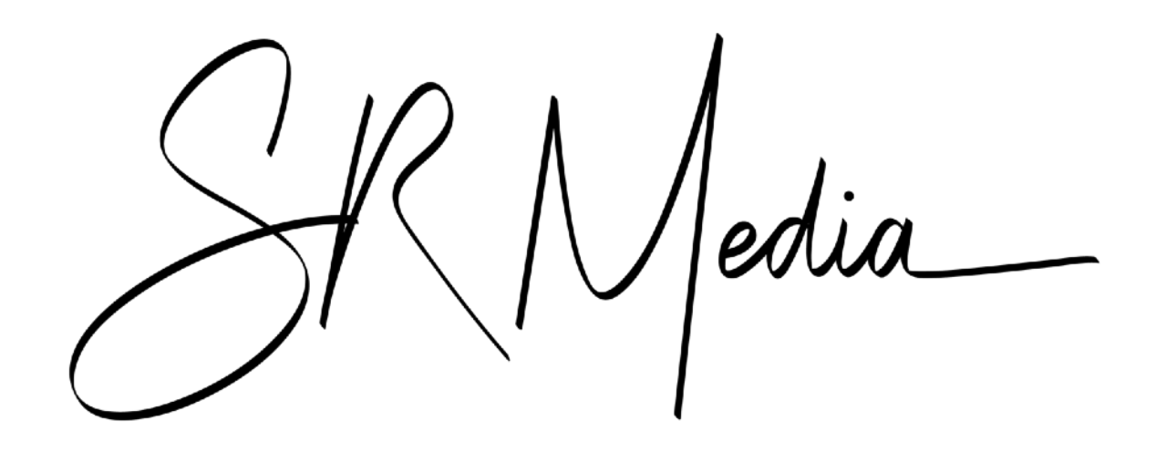
WEDDING PHOTOGRAPHY & CINEMATOGRAPHY INVESTMENT GUIDE