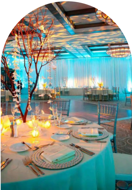
8 X ROOM UP LIGHTS