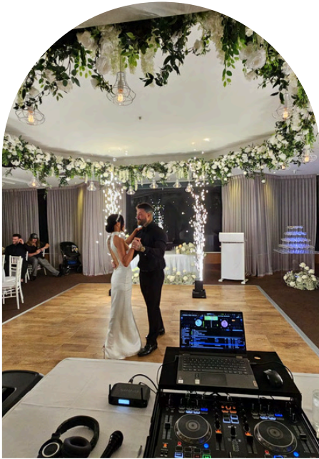
4 X COLD SPARKLERS