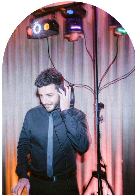
UPGRADED DANCE FLOOR LIGHTS