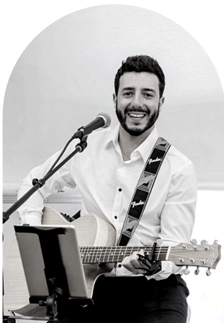
LIVE SOLOIST & DJ