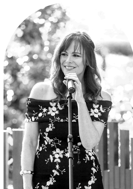
PRE – DRINKS