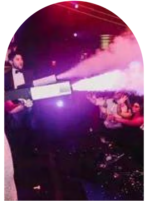
LED CO2 CANNON