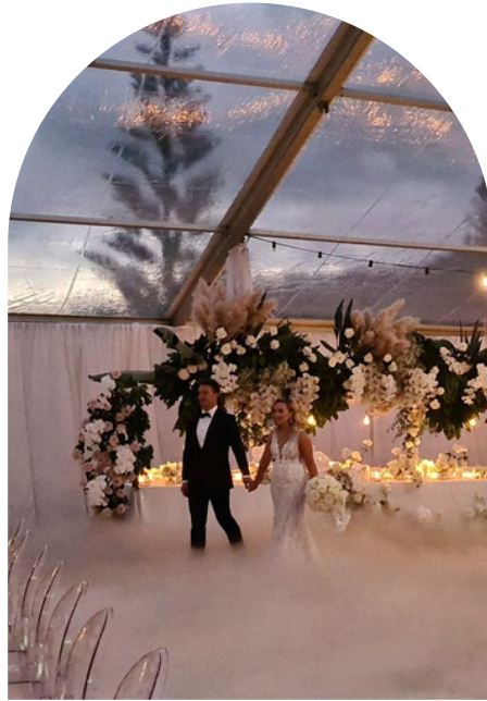
DANCING ON CLOUDS