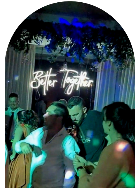
CUSTOM LED SIGNS