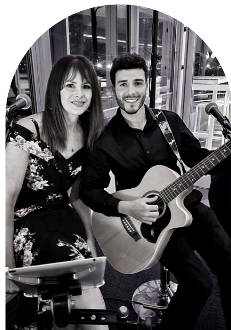
LIVE DUO & DJ