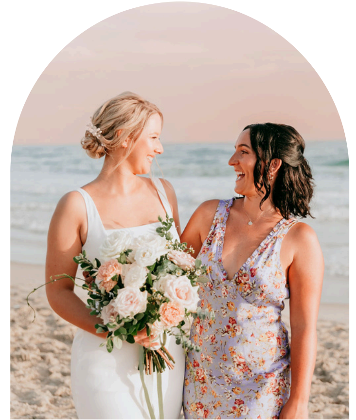
Additional Person For Makeup and Hair