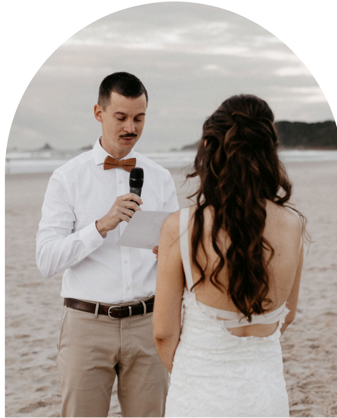
Additional Person For Hair