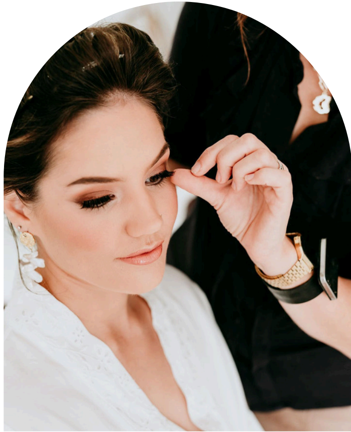
Additional Person For Makeup