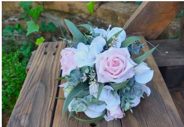
Flower girl posy Price $49