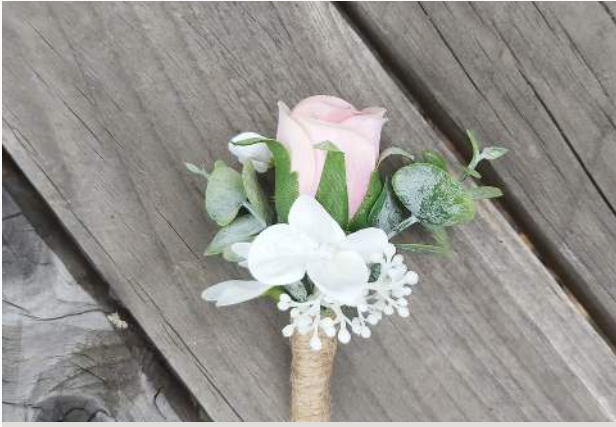
Buttonhole Price $25