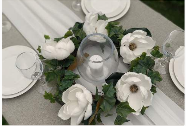
Wreath Price $135