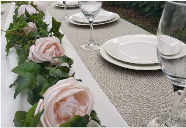
Garland Price $159