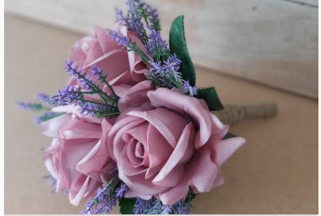
Flower girl posy Price $59