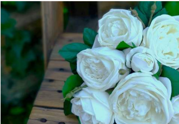
Bridal bouquet Price $199