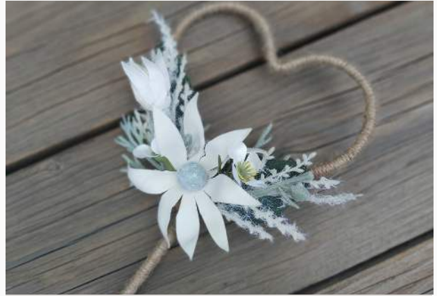
Flower wand Price $59