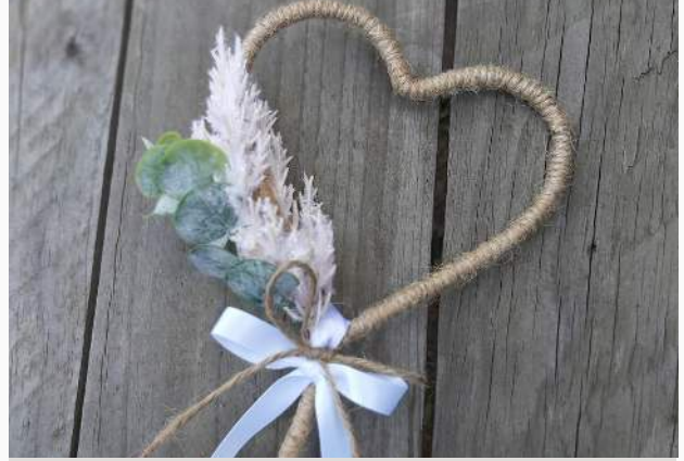
Flower wand Price $49