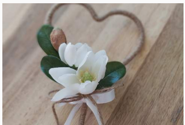
Flower wand Price $49