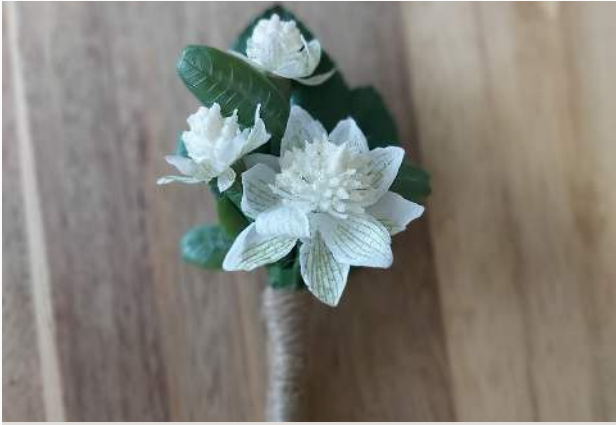
Buttonhole Price $19