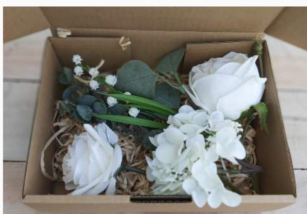
Sample box Price $59