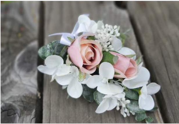
Corsage Price $39