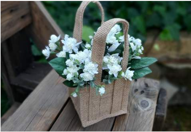
Flower girl basket Price $49