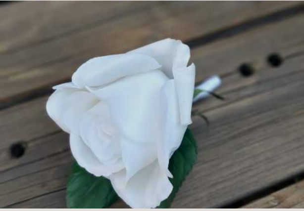
Buttonhole Price $25