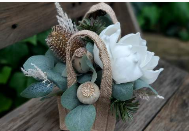
Flower girl basket Price $95