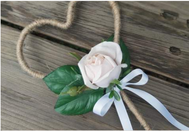
Flower wand Price $49