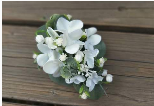
Corsage Price $39