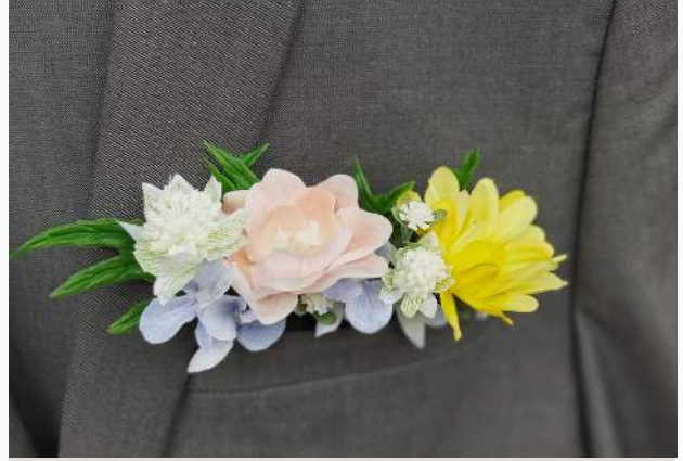
Pocket square Price $35