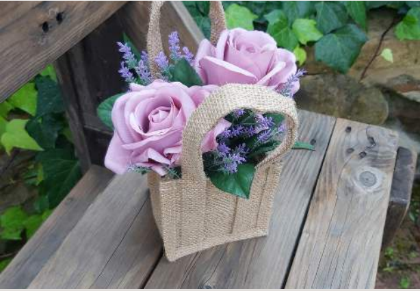
Flower girl basket Price $49