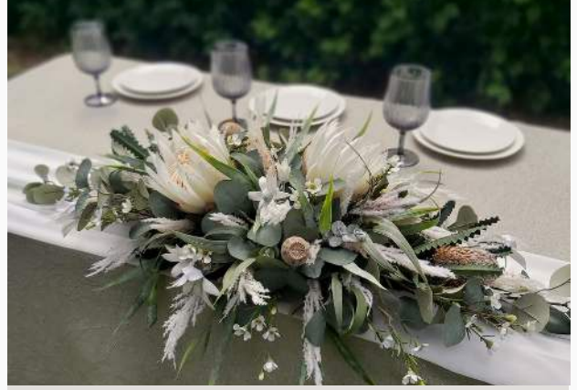
Table arrangement Price $359