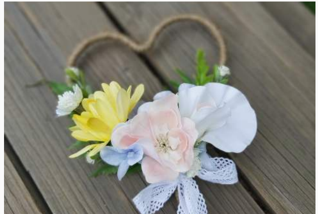
Flower wand Price $49