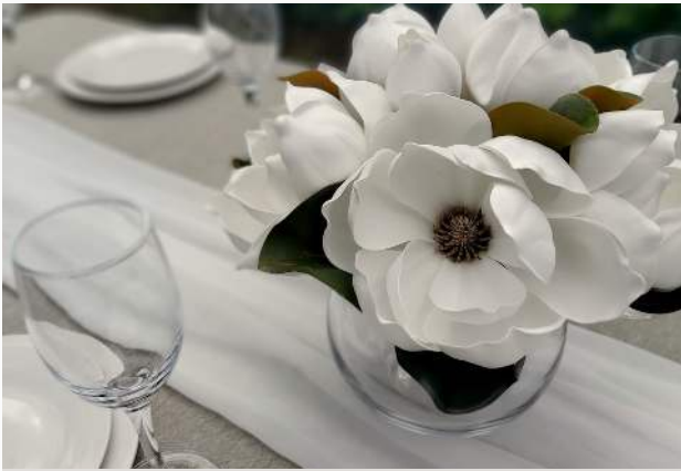
Vase arrangement Price $139