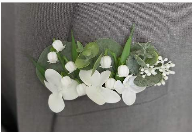
Pocket square Price $35