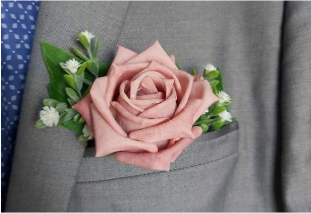
Pocket square Price $35