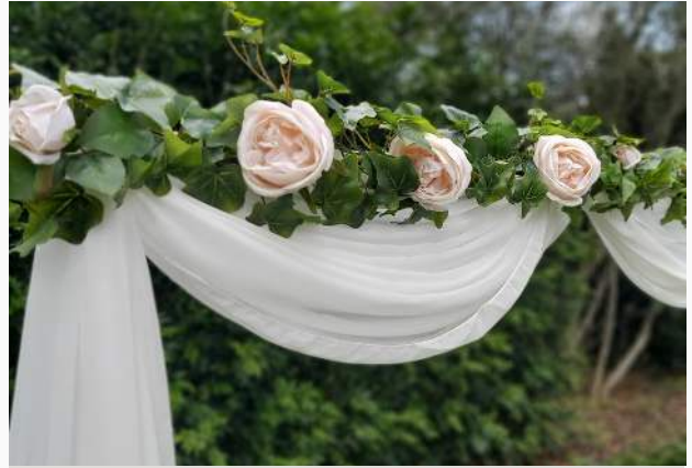
Arch garland Price $159