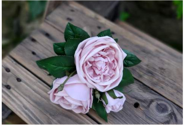
Flower girl posy Price $55