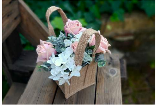
Flower girl basket Price $55