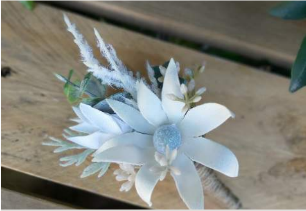
Buttonhole Price $25