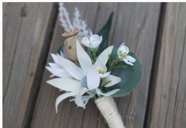
Buttonhole Price $35