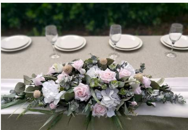
Table arrangement Price $289