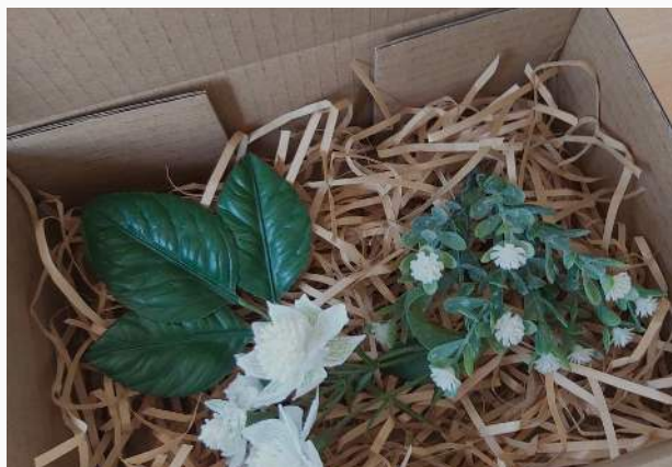
Sample box Price $29