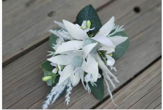
Corsage Price $35