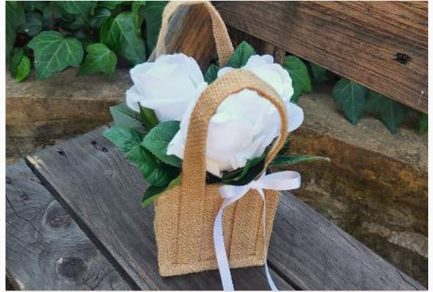
Flower girl basket Price $49