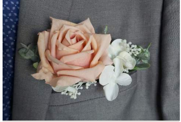
Pocket square Price $35