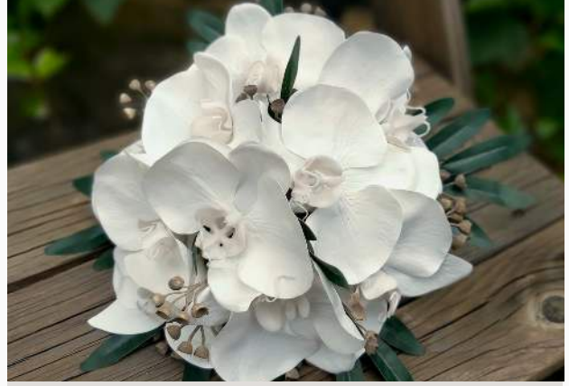
Bridesmaid bouquet Price $119