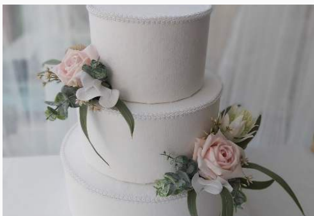
Cake flowers Price $49