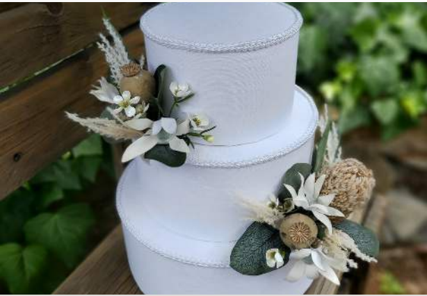
Cake flowers Price $69