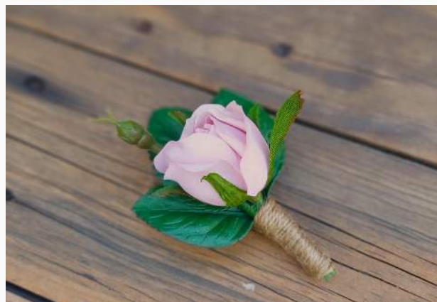
Buttonhole Price $25