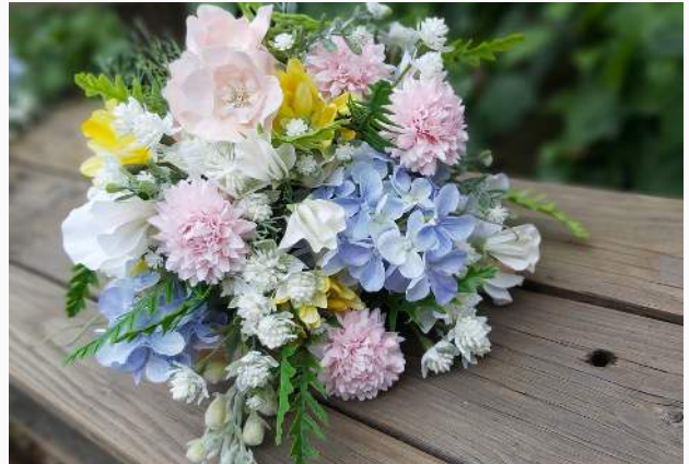
Bridesmaid bouquet Price $179