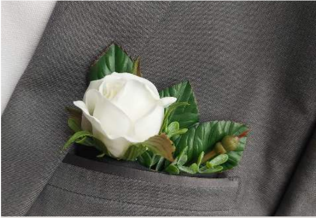
Pocket square Price $35