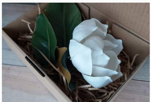
Sample box Price $49