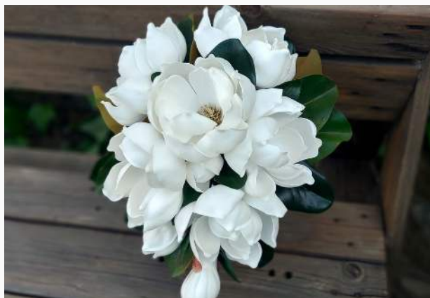
Trailing bouquet Price $299