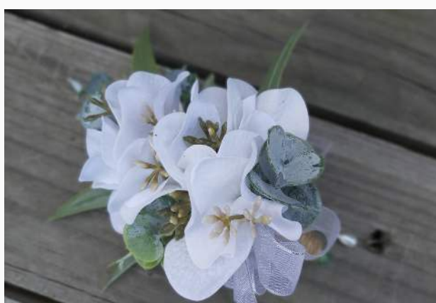
Corsage Price $29