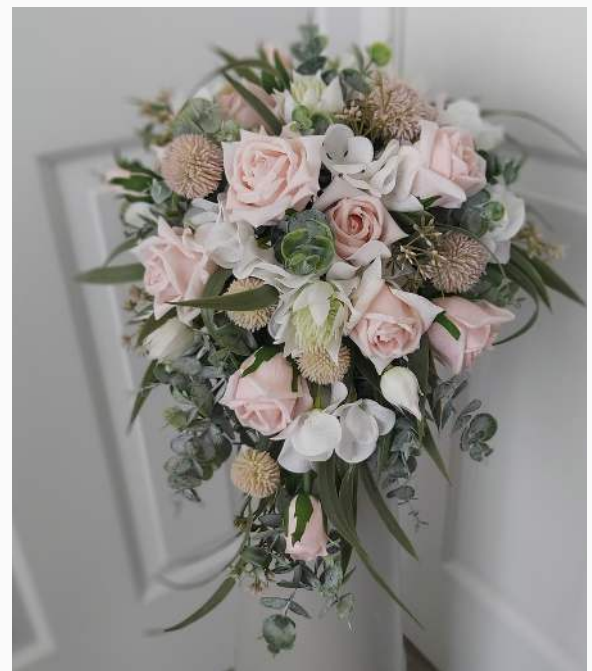
Bridal bouquet - trailing $269