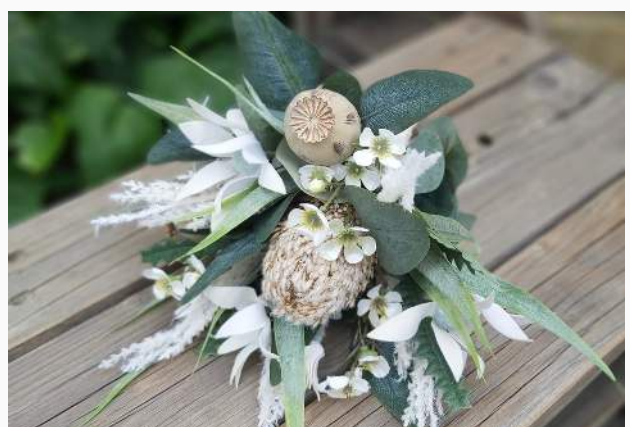
Flower girl posy Price $95