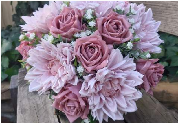
Bridal bouquet Price $199