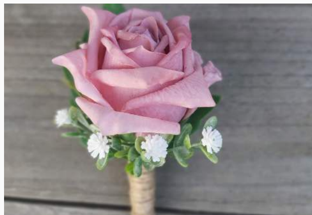
Buttonhole Price $25