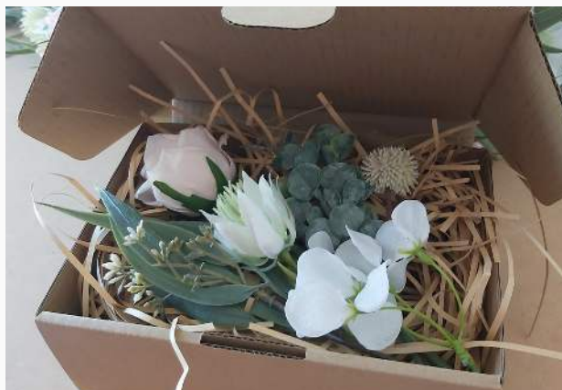
Sample box Price $39