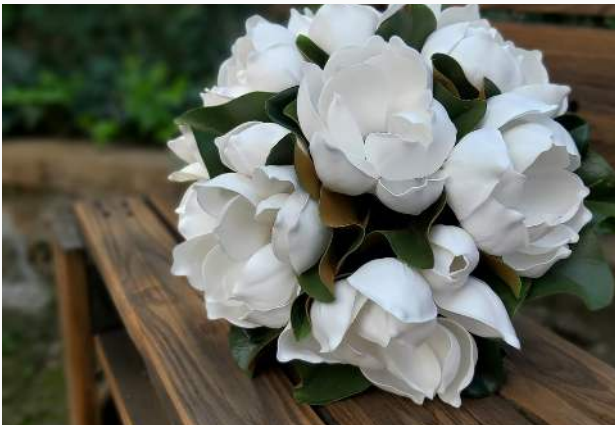
Bridal bouquet-round Price $269