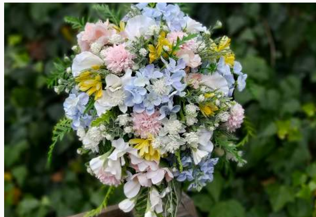
Trailing bouquet Price $229