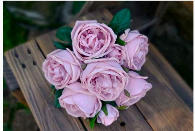
Bridesmaid bouquet Price $169