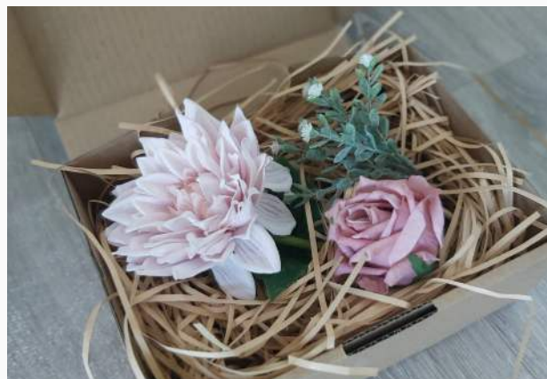
Sample box Price $39