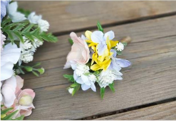
Buttonhole Price $29