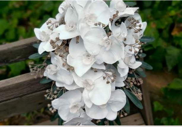
Bridal bouquet Price $259