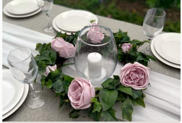
Wreath Price $115