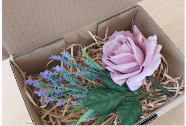
Sample box Price $29