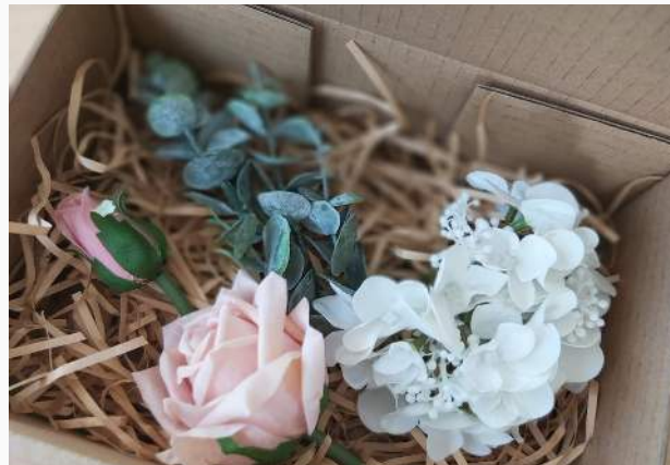
Sample box Price $35