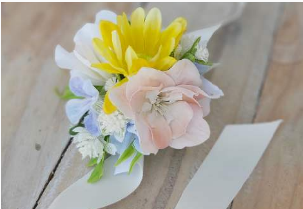
Wrist corsage Price $39