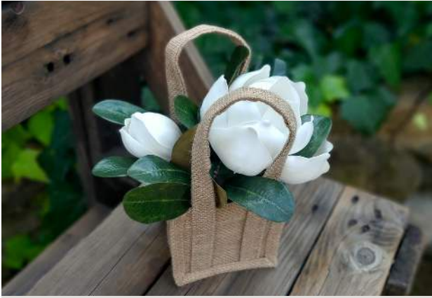
Flower girl basket Price $49