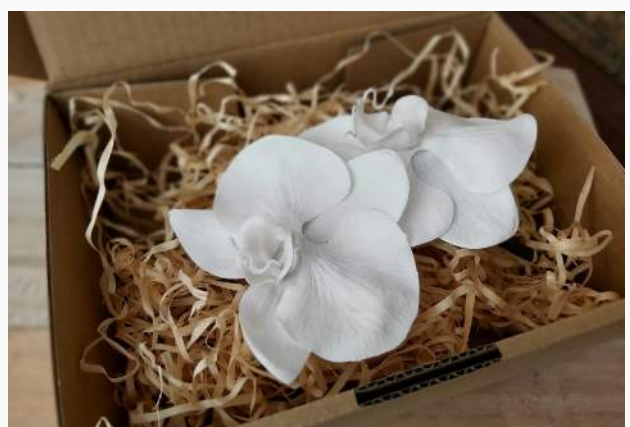
Sample box Price $39