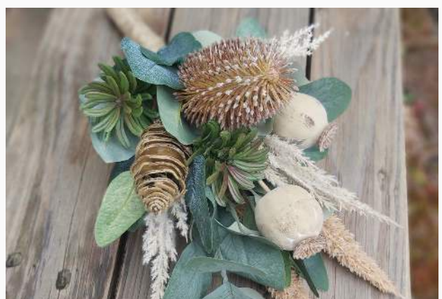
Flower girl posy Price $95