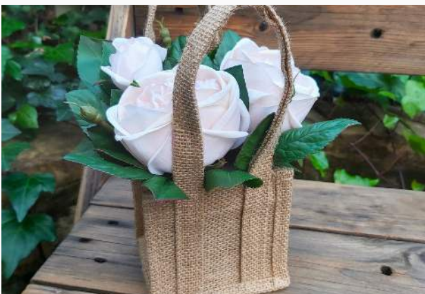
Flower girl basket Price $59