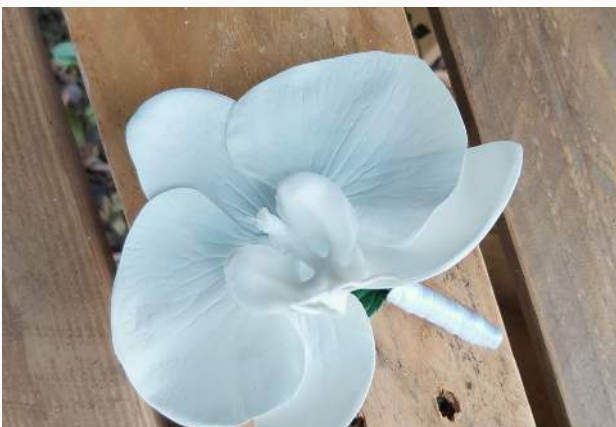
Buttonhole Price $25