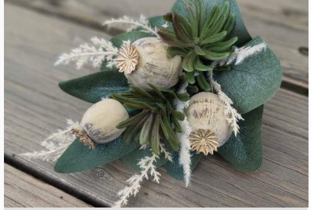
Corsage Price $49