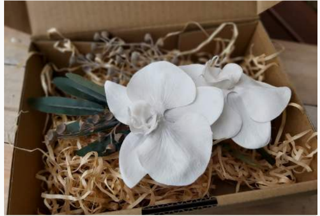
Sample box Price $45