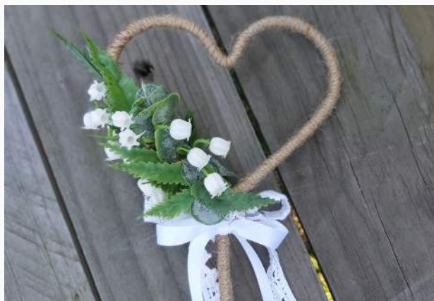
Flower wand Price $49