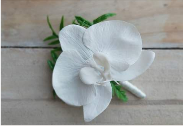
Buttonhole Price $25