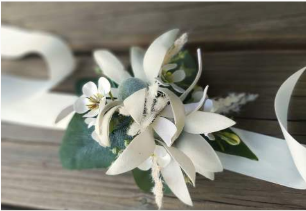
Wrist corsage Price $39