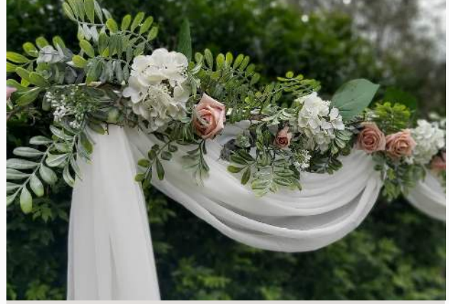
Arch garland Price $185