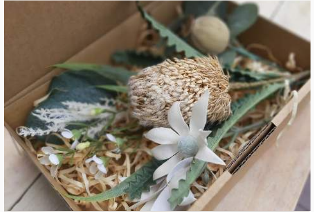
Sample box Price $69