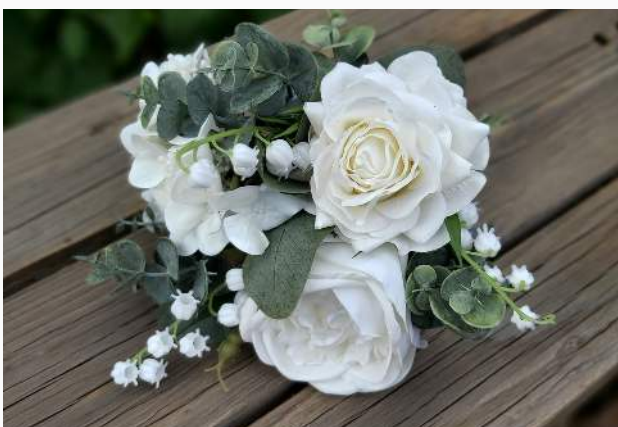
Flower girl posy Price $89