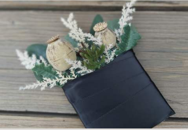
Pocket square Price $49