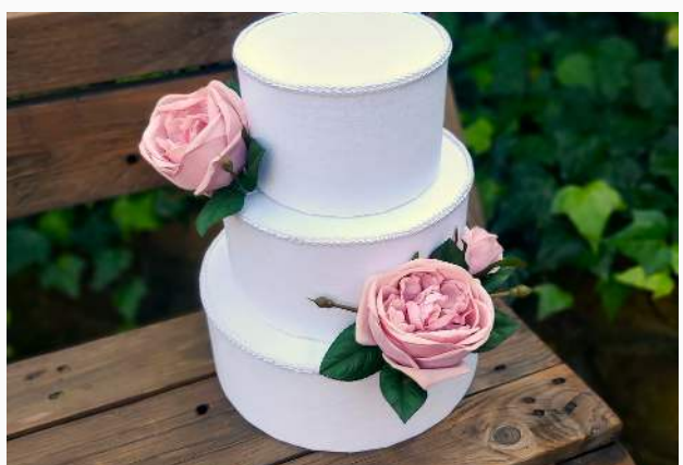
Cake flowers Price $55