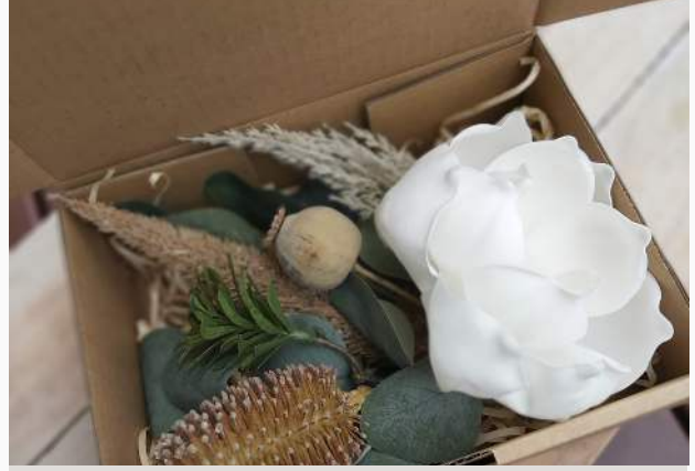
Sample box Price $59