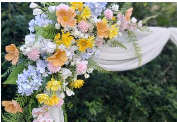
Arch flowers Price $319