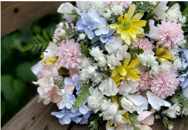
Bridal bouquet-round Price $239