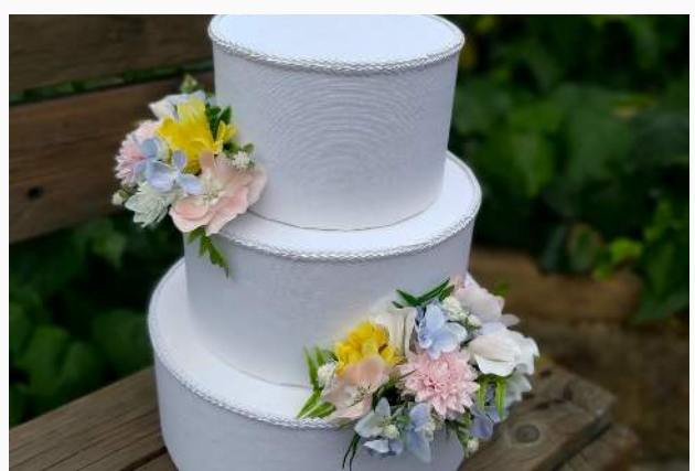
Cake flowers Price $69