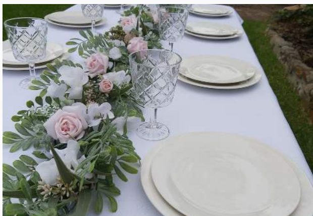
Garland Price $210