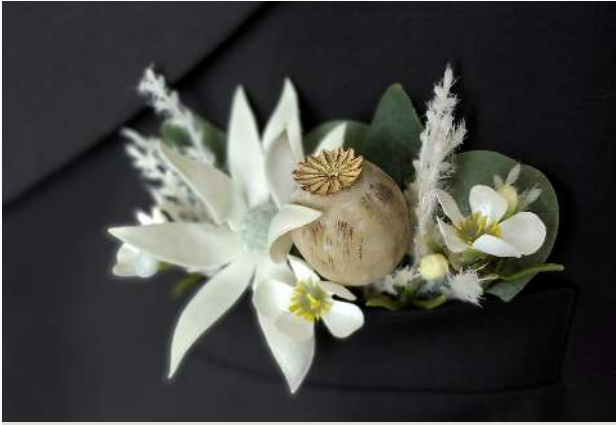
Pocket square Price $35