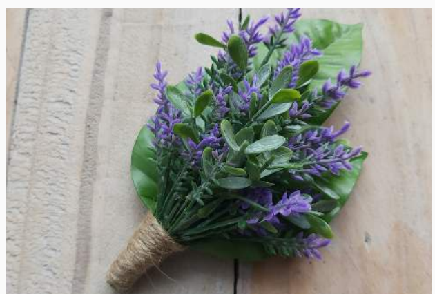
Corsage Price $30