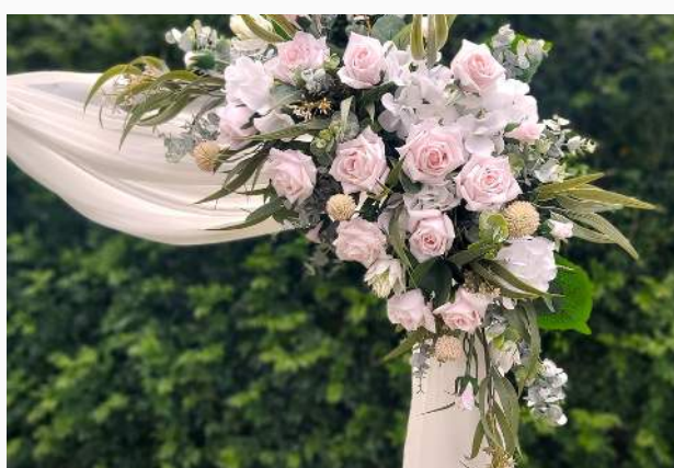
Arch flowers Price $279