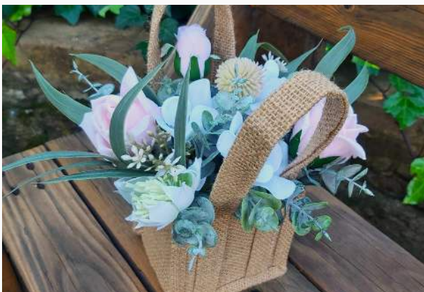
Flower girl basket Price $49