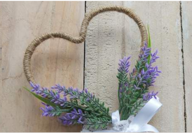
Flower wand Price $49