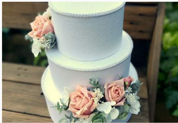
Cake flowers Price $65