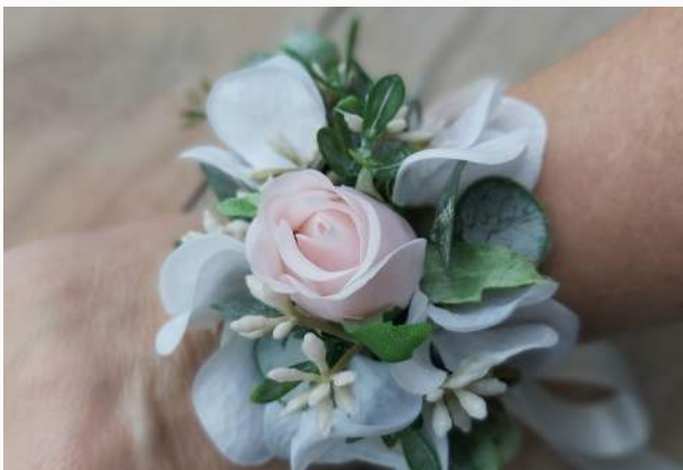
Wrist corsage Price $59