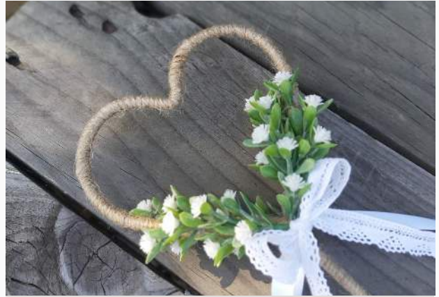
Flower wand Price $49