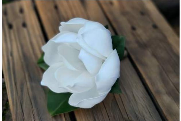
Corsage Price $39