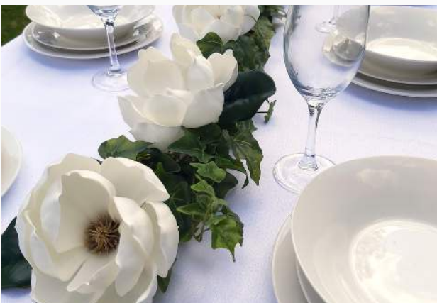
Garland Price $189