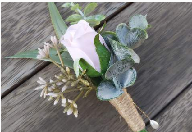
Buttonhole - rose Price $25