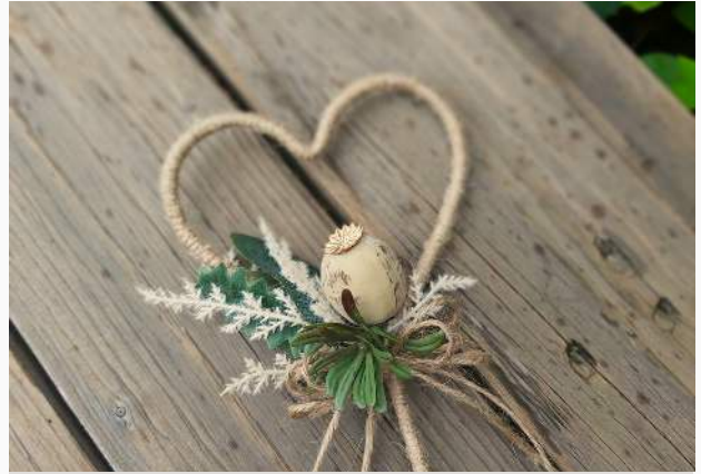
Flower wand Price $59