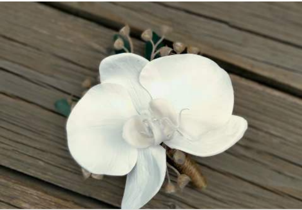
Buttonhole Price $25