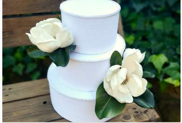
Cake flowers Price $65