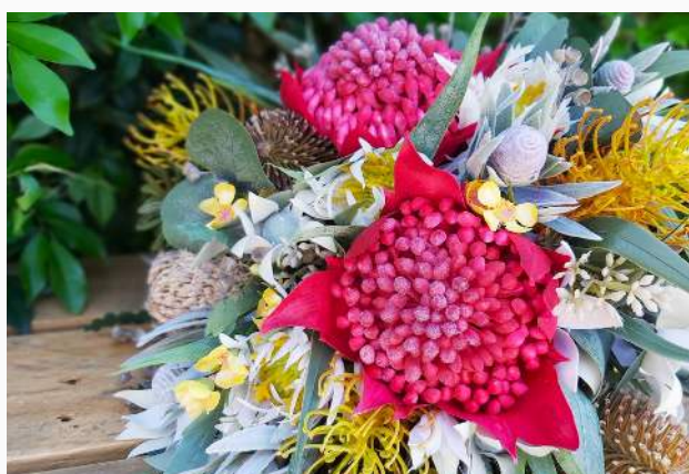
Bridal bouquet Price $379