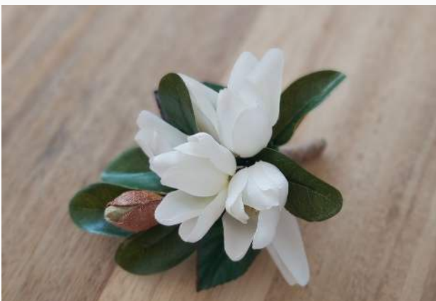
Corsage Price $35