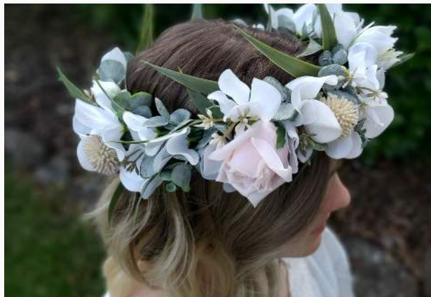
Flower crown Price $99