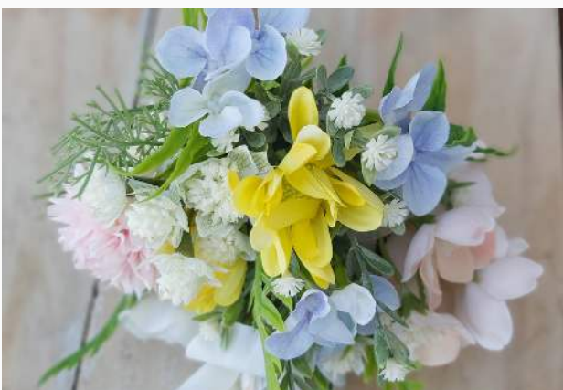
Flower girl posy Price $69