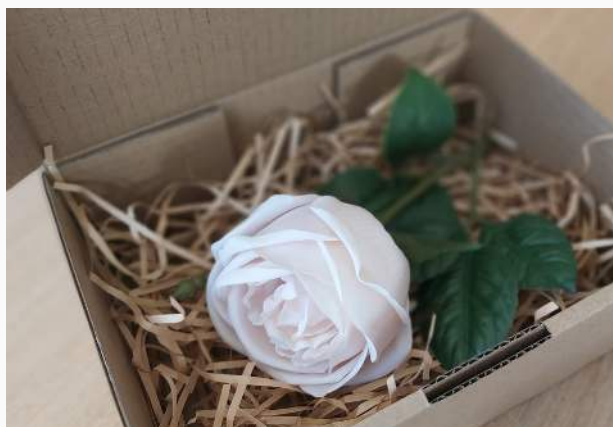
Sample box Price $35