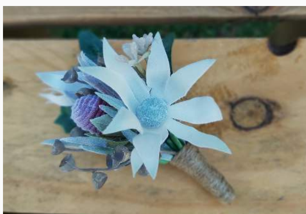
Buttonhole Price $25