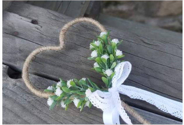
Flower wand Price $49