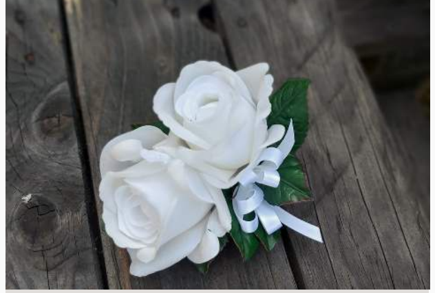
Corsage Price $39