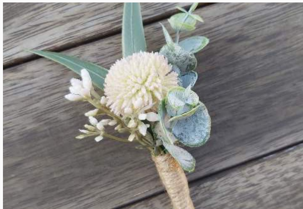
Buttonhole - billy button Price $25