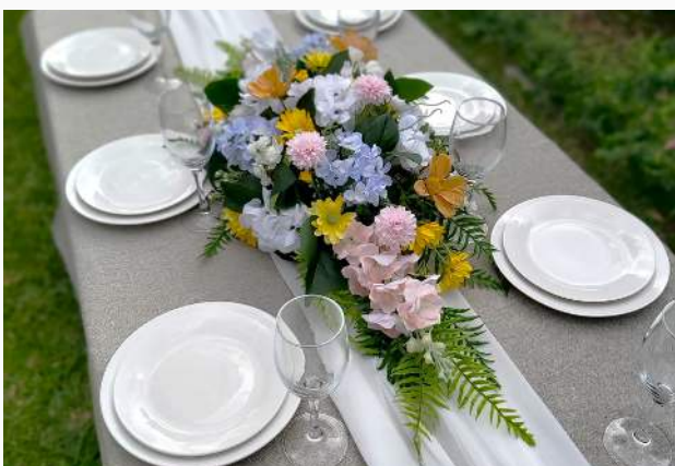
Table arrangement Price $265