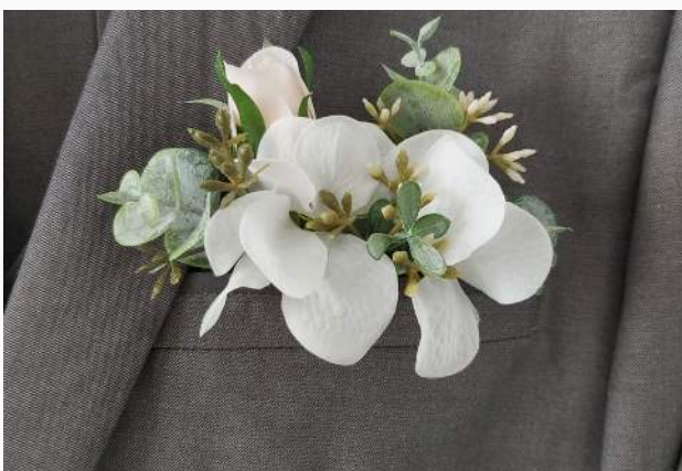
Pocket square Price $49