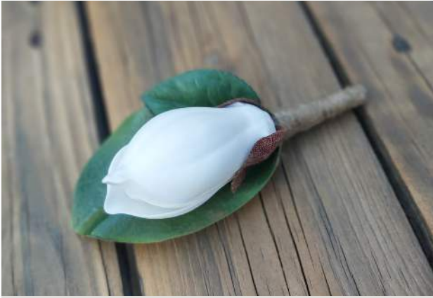
Buttonhole Price $29