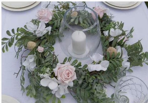
Wreath Price $125