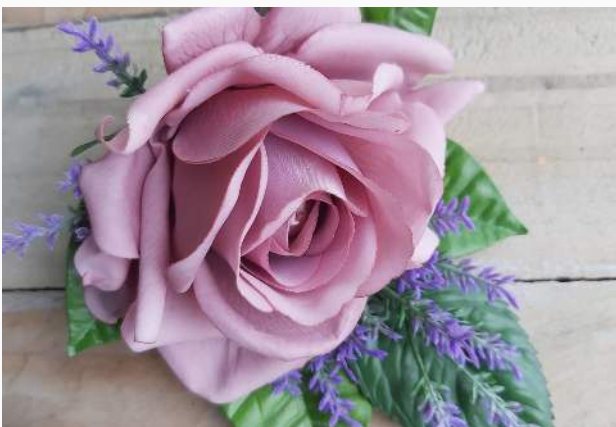
Corsage Price $35