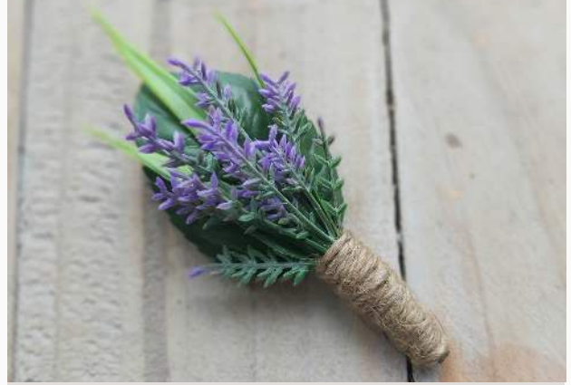
Buttonhole Price $20