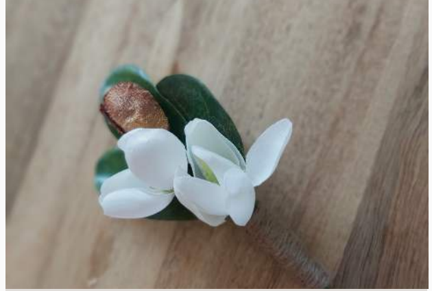
Buttonhole Price $29