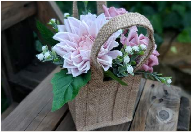
Flower girl basket Price $55