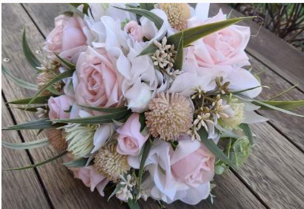
Bridesmaid bouquet Price $159