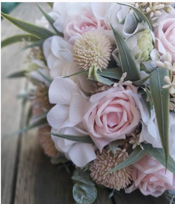
Bridal bouquet - round $239