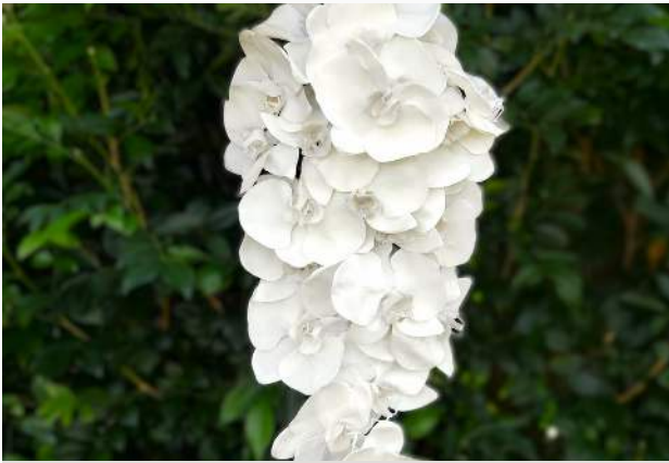
Bridal bouquet Price $239