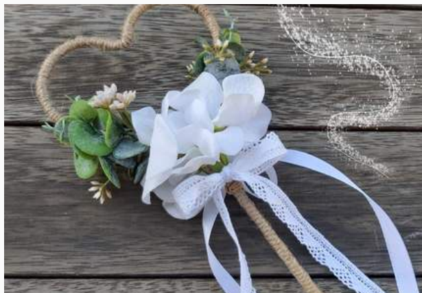
Flower wand Price $49