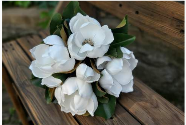
Bridesmaid bouquet Price $189