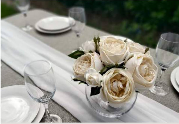
Vase arrangement Price $109