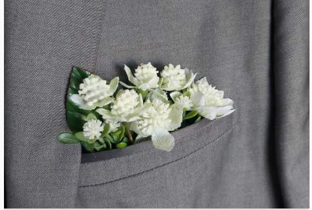
Pocket square Price $29