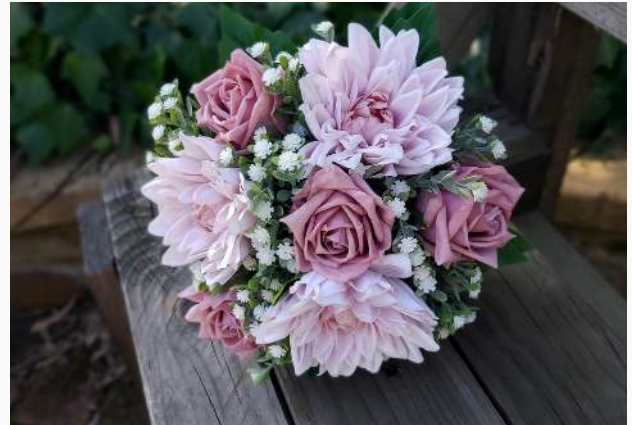
Bridesmaid bouquet Price $139