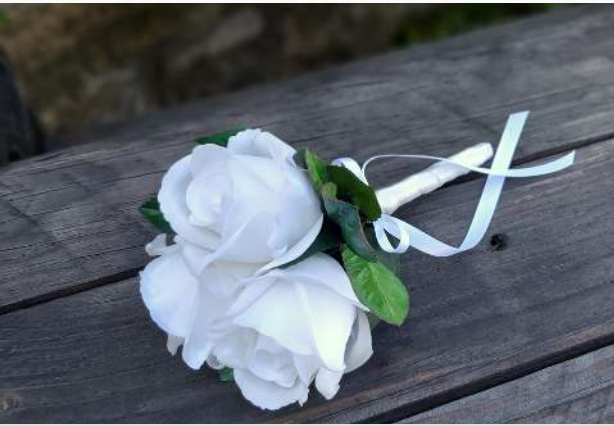
Flower girl posy Price $45