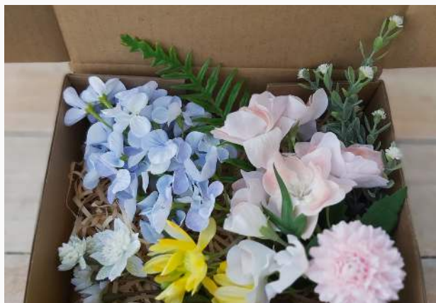
Sample box Price $59