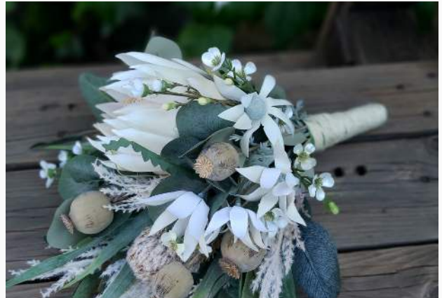
Bridesmaid bouquet Price $189