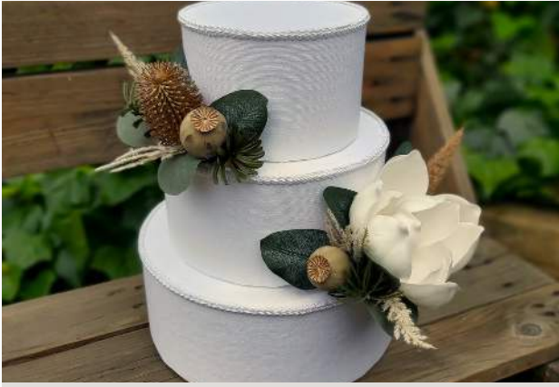
Cake flowers Price $69