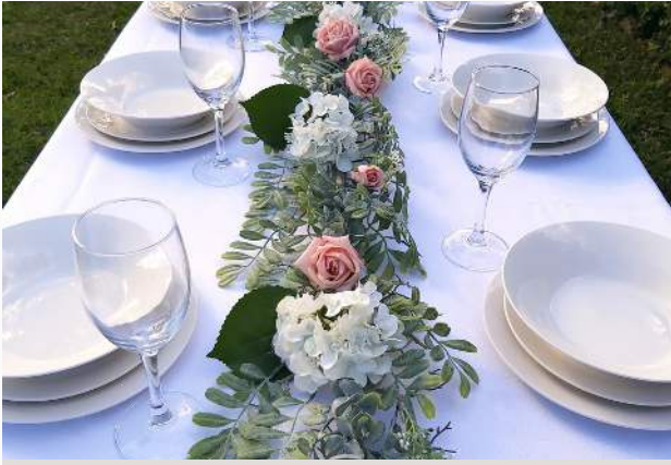
Garland Price $185