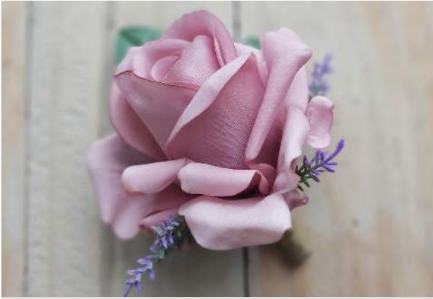
Buttonhole Price $25