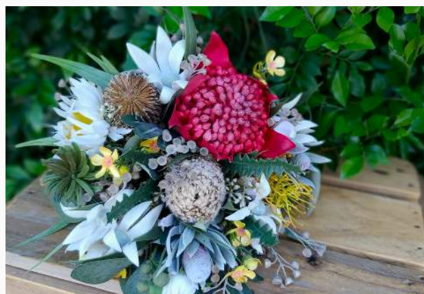
Bridesmaid bouquet Price $239