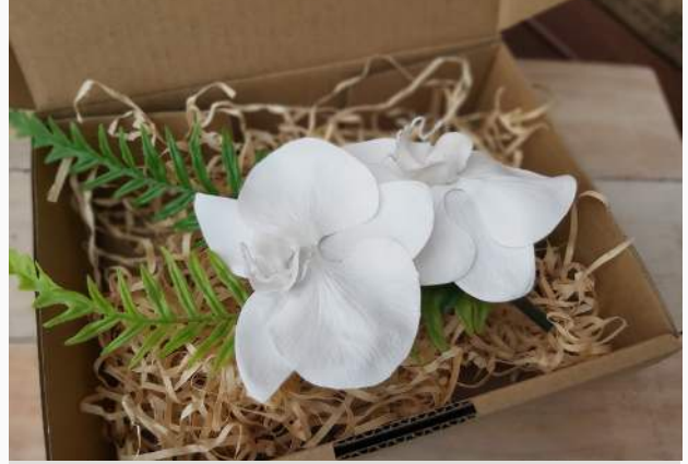
Sample box Price $39