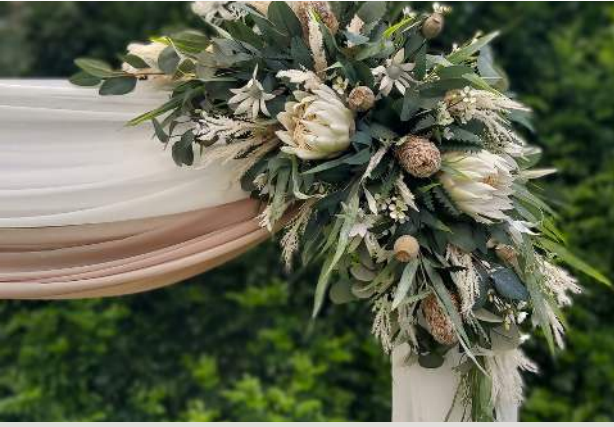
Arch flowers Price $395