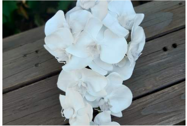
Bridesmaid bouquet Price $109