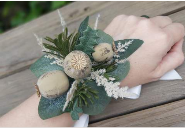
Wrist corsage Price $65