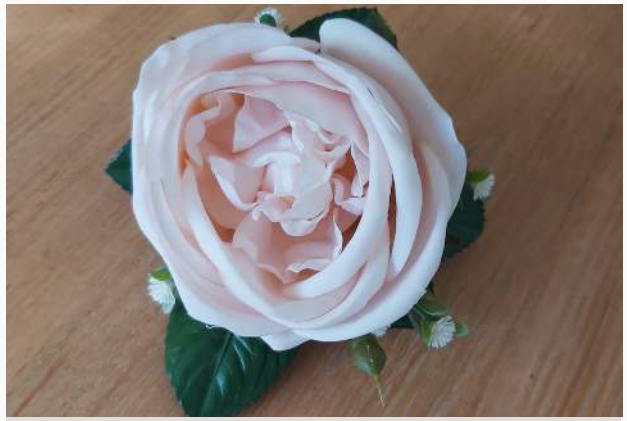
Corsage Price $35