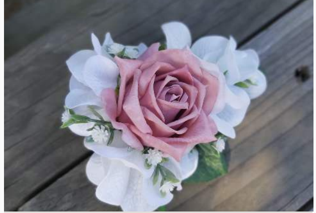
Corsage Price $29