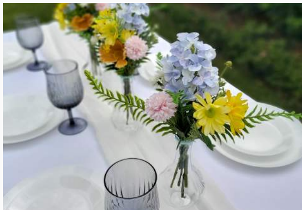
Mini vase Price $50 ea