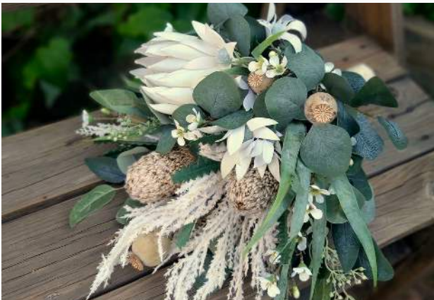
Bridal bouquet Price $295