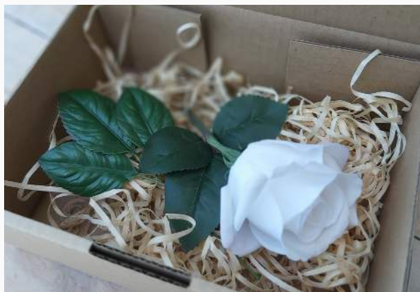
Sample box Price $29