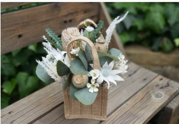
Flower girl basket Price $85