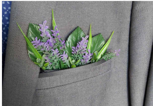
Pocket square Price $29