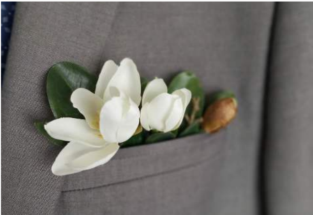
Pocket square Price $39