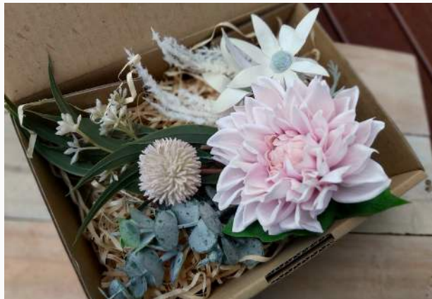
Sample box Price $39