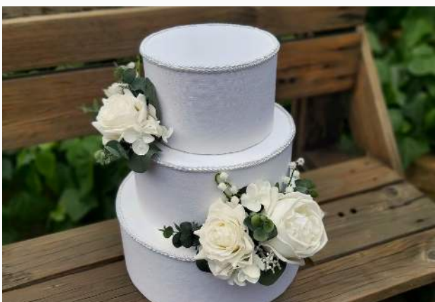
Cake flowers Price $79