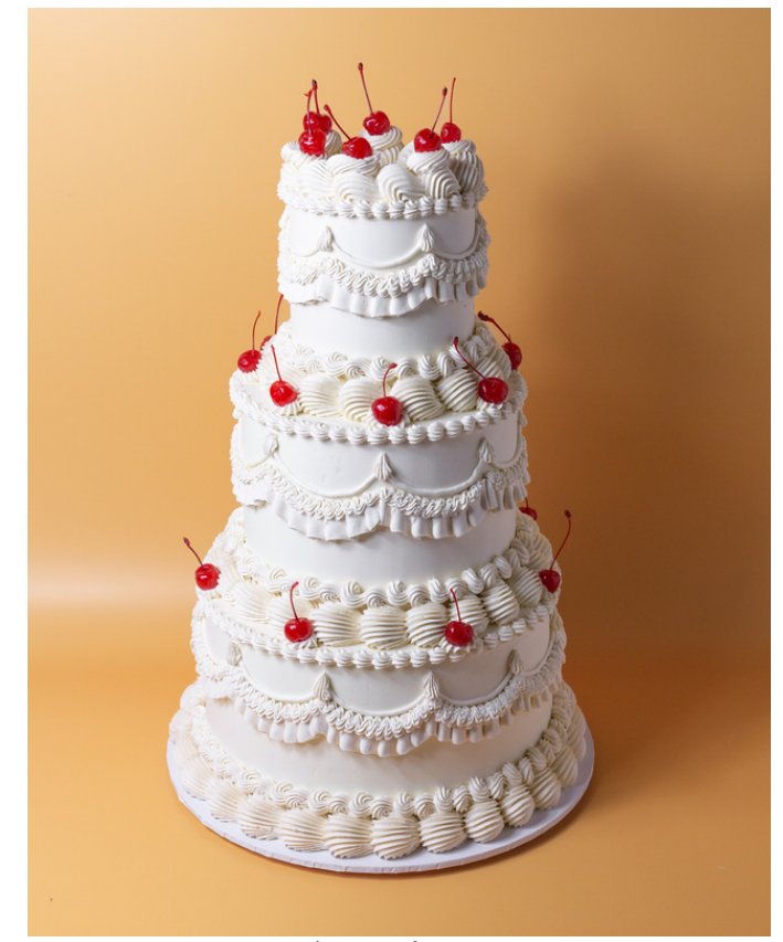
5+8+11 vintage buttercream