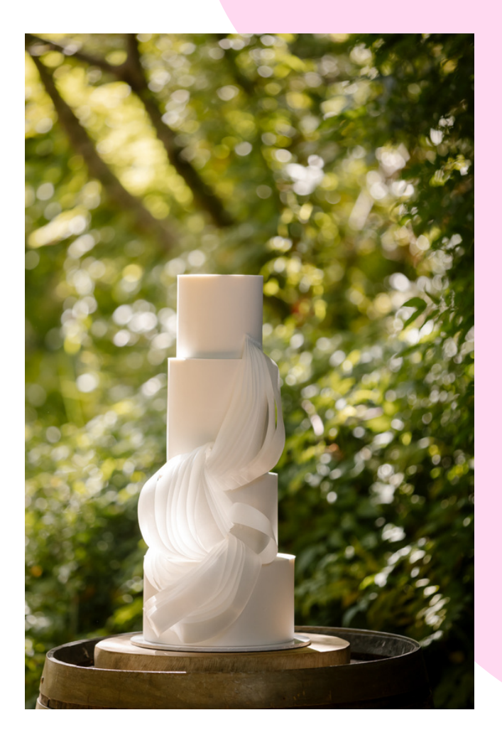
5+7+9+11" wide 400 coffee or 200 dessert from $1350 incl. GST

4+6+8+10" wide (pictured) 330 coffee or 165 dessert from $1100 incl. GST