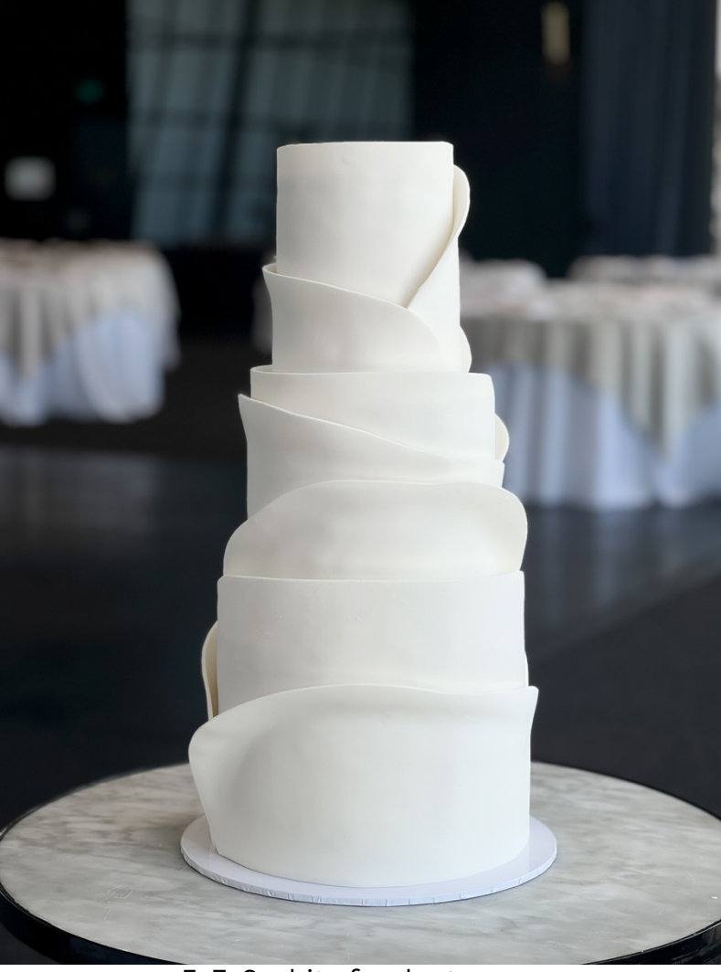
5+7+9 white fondant wrap

6+9+12" wide 330 coffee or 165 dessert from $950 incl. GST