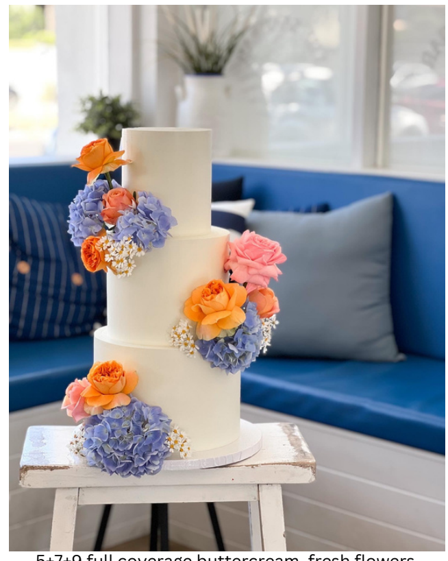
5+7+9 full coverage buttercream, fresh flowers