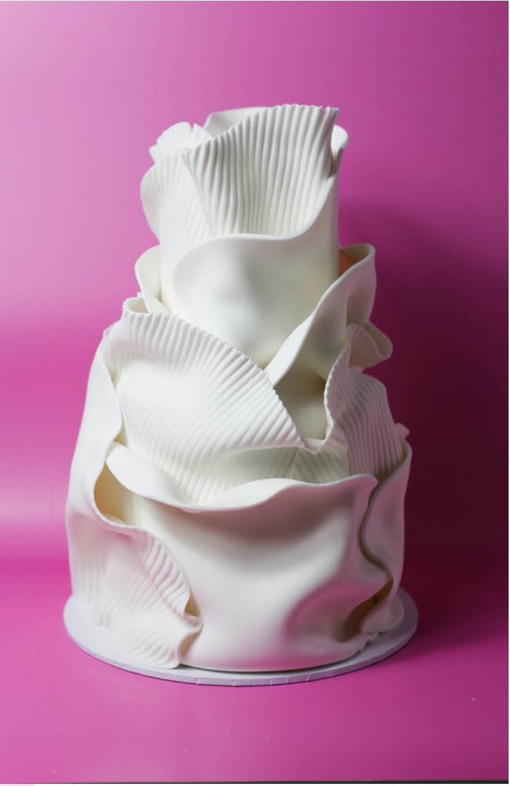
5+7 organic draped with mixed textures