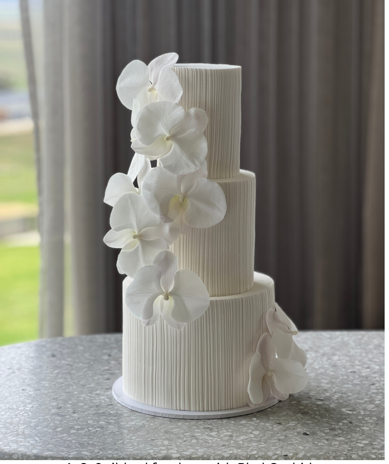
4+6+8 ribbed fondant with Phal Orchids