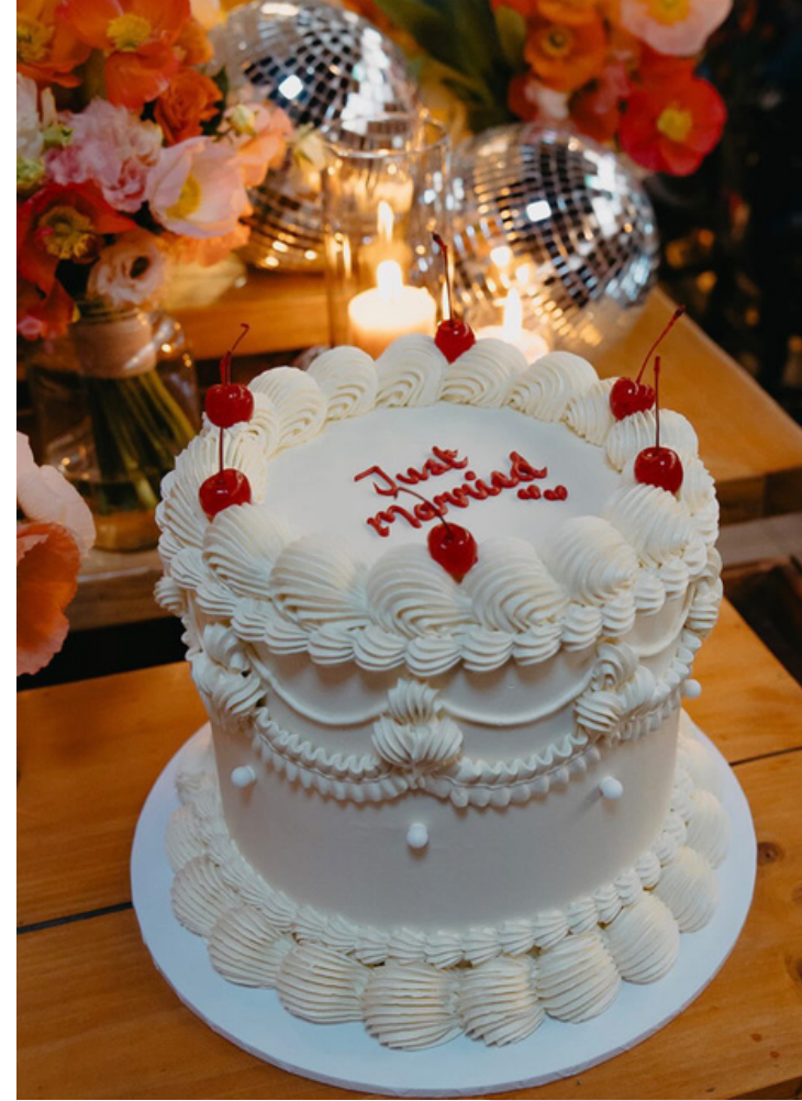
8 inch buttercream cake with vintage piping and maraschino cherries.

6 inch buttercream cake with texture, pearl airbrush and fresh flowers.