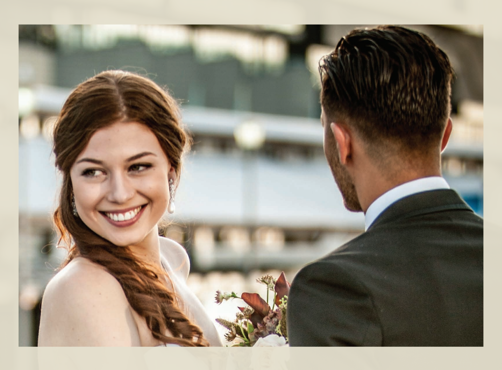
YOUR BIG DAY MEANS A LOT TO US TOO