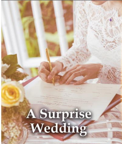
A Surprise Wedding