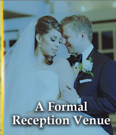
A Formal Reception Venue