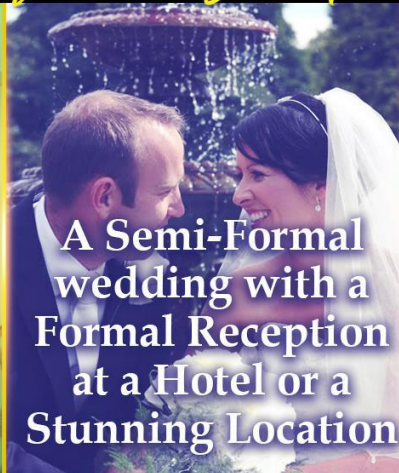
A Semi-Formal wedding with a Formal Reception at a Hotel or a Stunning Location