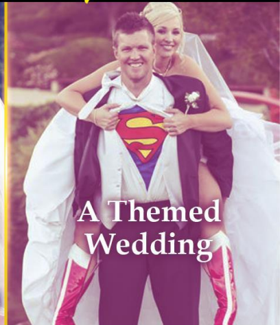
A Themed Wedding