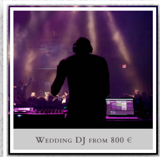
WEDDING DJ FROM 800 €