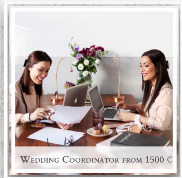
WEDDING COORDINATOR FROM 1500 €