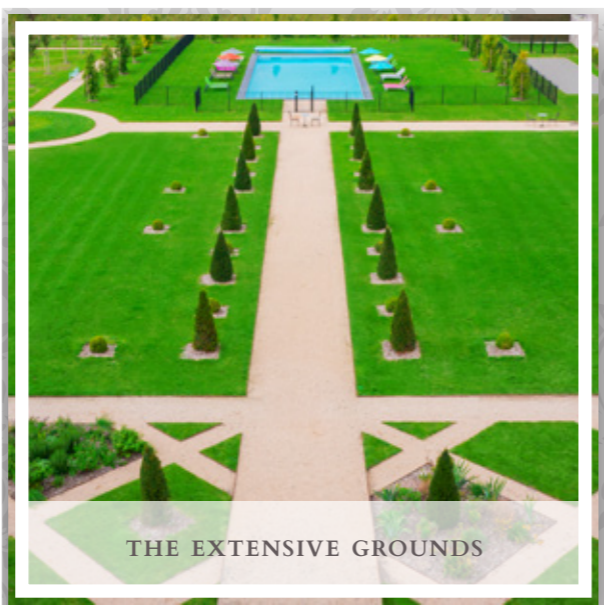
THE EXTENSIVE GROUNDS