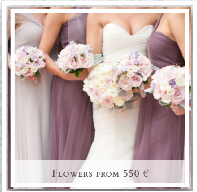
FLOWERS FROM 550 €