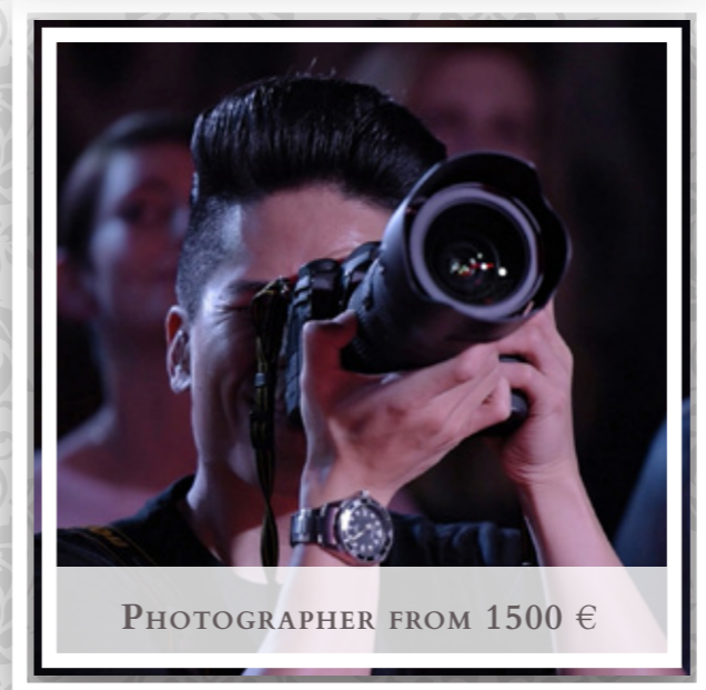
PHOTOGRAPHER FROM 1500 €