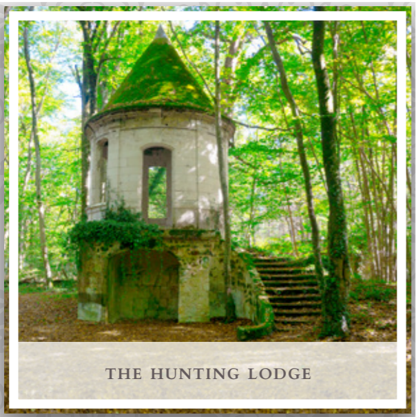
THE HUNTING LODGE