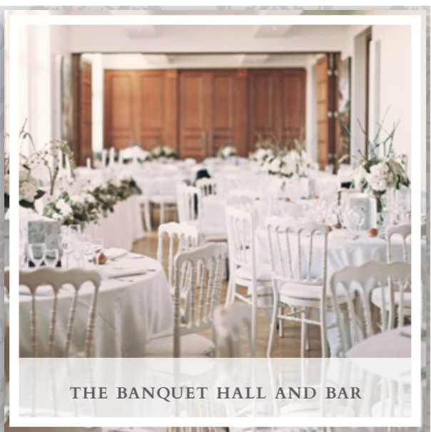
THE BANQUET HALL AND BAR