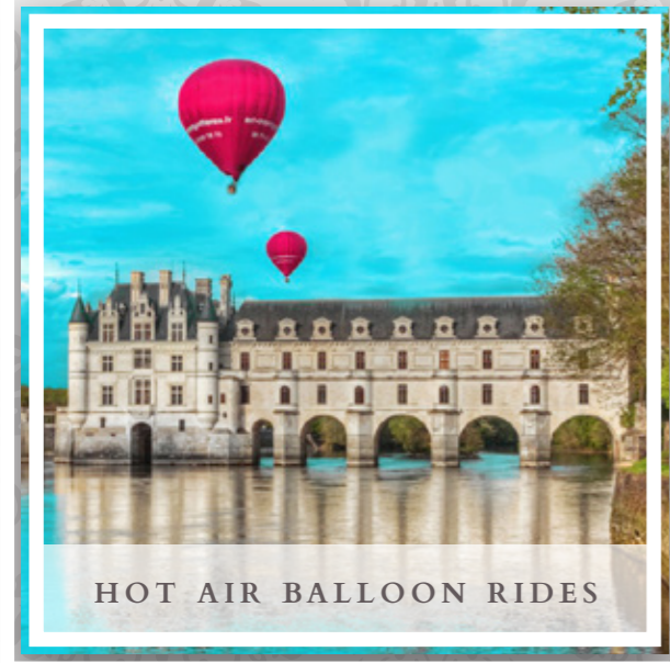
HOT AIR BALLOON RIDES