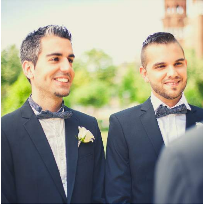
Bentex Suits Lookbook